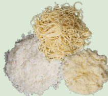
Pasta, couscous, potatoes, rice, oatmeal, flour, grains