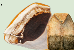
Coffee grounds, filters, tea bags