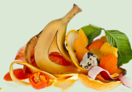
Fruit cores, pits and peels