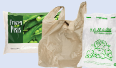
Bags and overwrap (soft and stretchy)