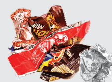
Plastic or foil candy/chocolate wrappers, chip bags, aluminum foil