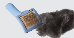
Hair, pet hair, feathers, nail clippings, dryer lint