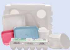
Foam food and protective packaging