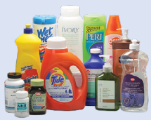
Bottles, jugs (lids on)