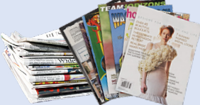
Newspapers, flyers, magazines