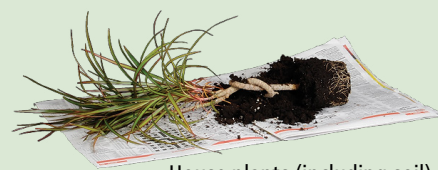
House plants (including soil)