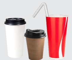
Hot and cold drink cups, straws (recycle non-black lids and sleeves)