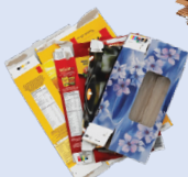
Cereal boxes, tissue boxes and other boxboard (flattened)