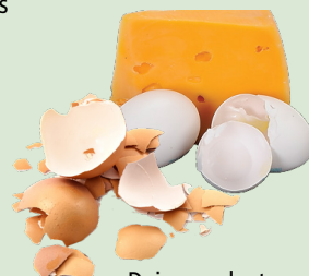
Dairy products, eggs and shells