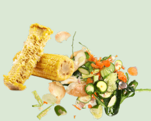
Vegetable scraps and peels, corn cobs and husks