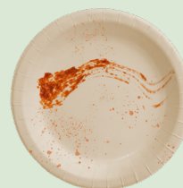
Soiled paper plates