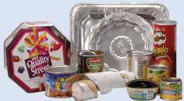
Food and drink containers (place lid inside can and pinch closed)