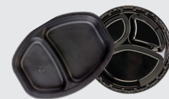
Black plastic (e.g. food containers, bags, cutlery, lids)