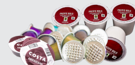
Coffee pods (any type)