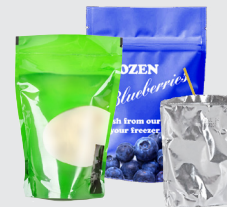
Stand-up pouches, drink pouches, straws