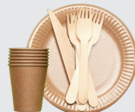
Compostable, biodegradable containers, cups, cutlery