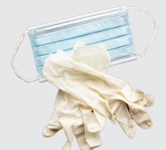
Personal protective equipment (masks, gloves)