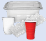
Clear food containers, clear or non-black disposable plates, cups