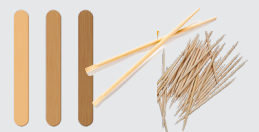
Popsicle sticks, toothpicks, chopsticks