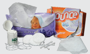
Dryer and disposable mop sheets, baby wipes, make-up pads, cotton tipped swabs, dental floss