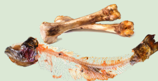
Meat, fish, shellfish (including bones)