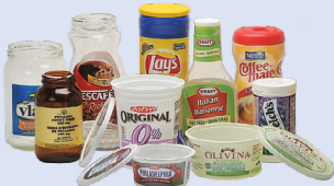
Food jars, tubs (lids on)