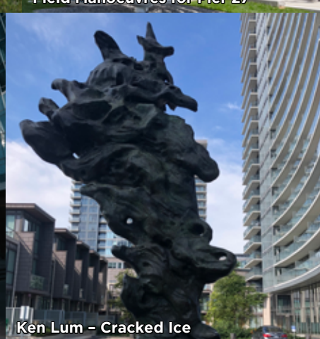
Ken Lum - Cracked Ice