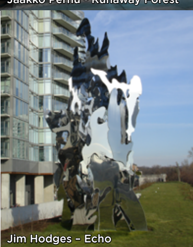
Jim Hodges - Echo