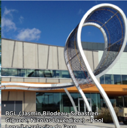
BGL (Jasmin Bilodeau, Sébastien Giguère, Nicolas Laverdière) - Pool Lane/La vitesse de l'eau