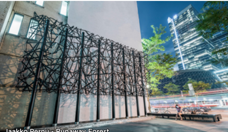
Jaakko Pernu - Runaway Forest