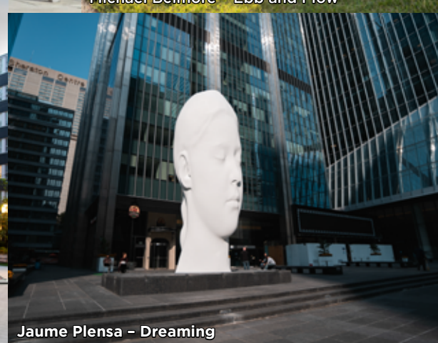
Jaume Plensa - Dreaming