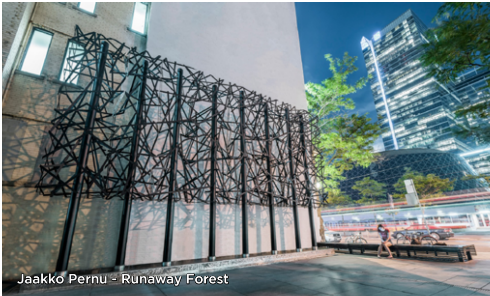
Jaakko Pernu - Runaway Forest