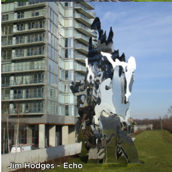
Jim Hodges - Echo