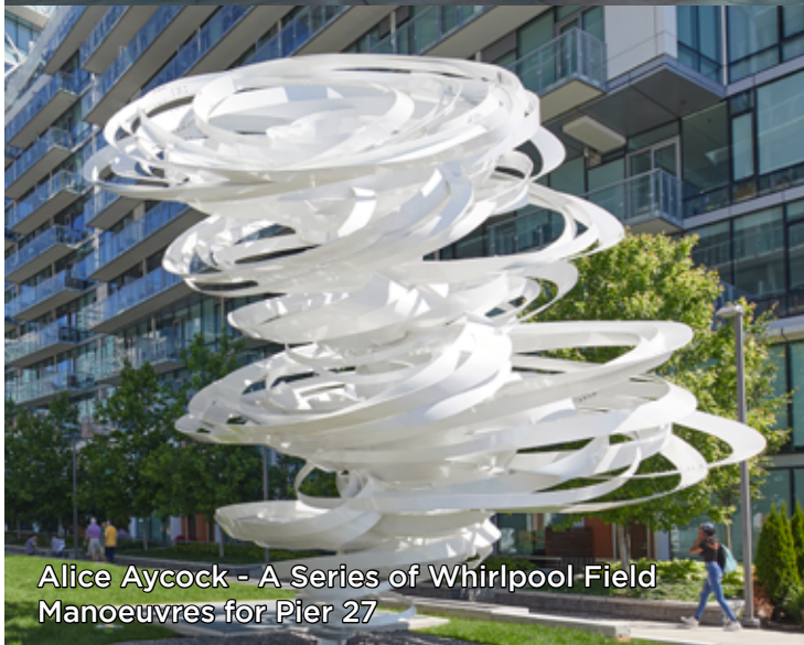
Alice Aycock - A Series of Whirlpool Field Manoeuvres for Pier 27