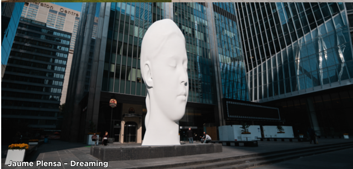
Jaume Plensa - Dreaming