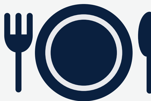
Serves meals and warm drinks