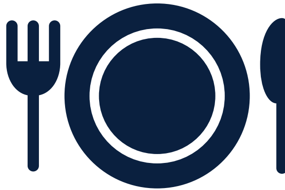
Serves meals and warm drinks

Bloor St W & Dovercourt Rd. operated by Sistering