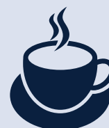
Serves warm drinks and snacks only