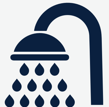
Washrooms and showers available