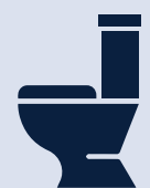
Washroom access only