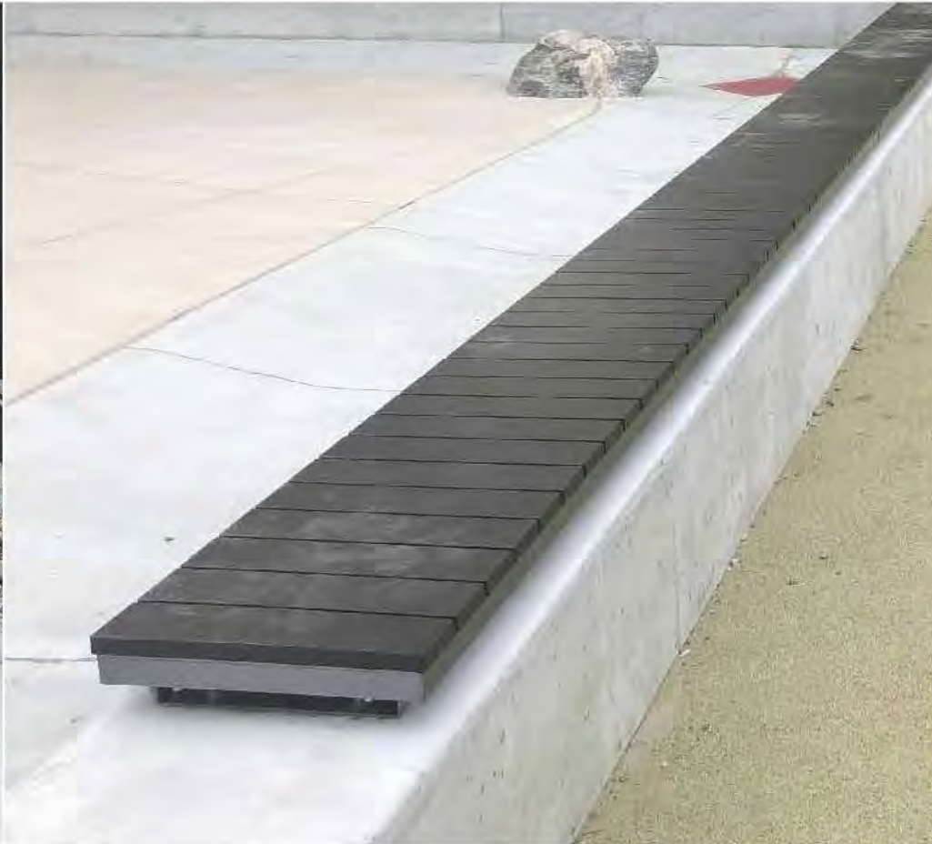
BACKLESS BENCH TOP ON LOW CONCRETE WALL