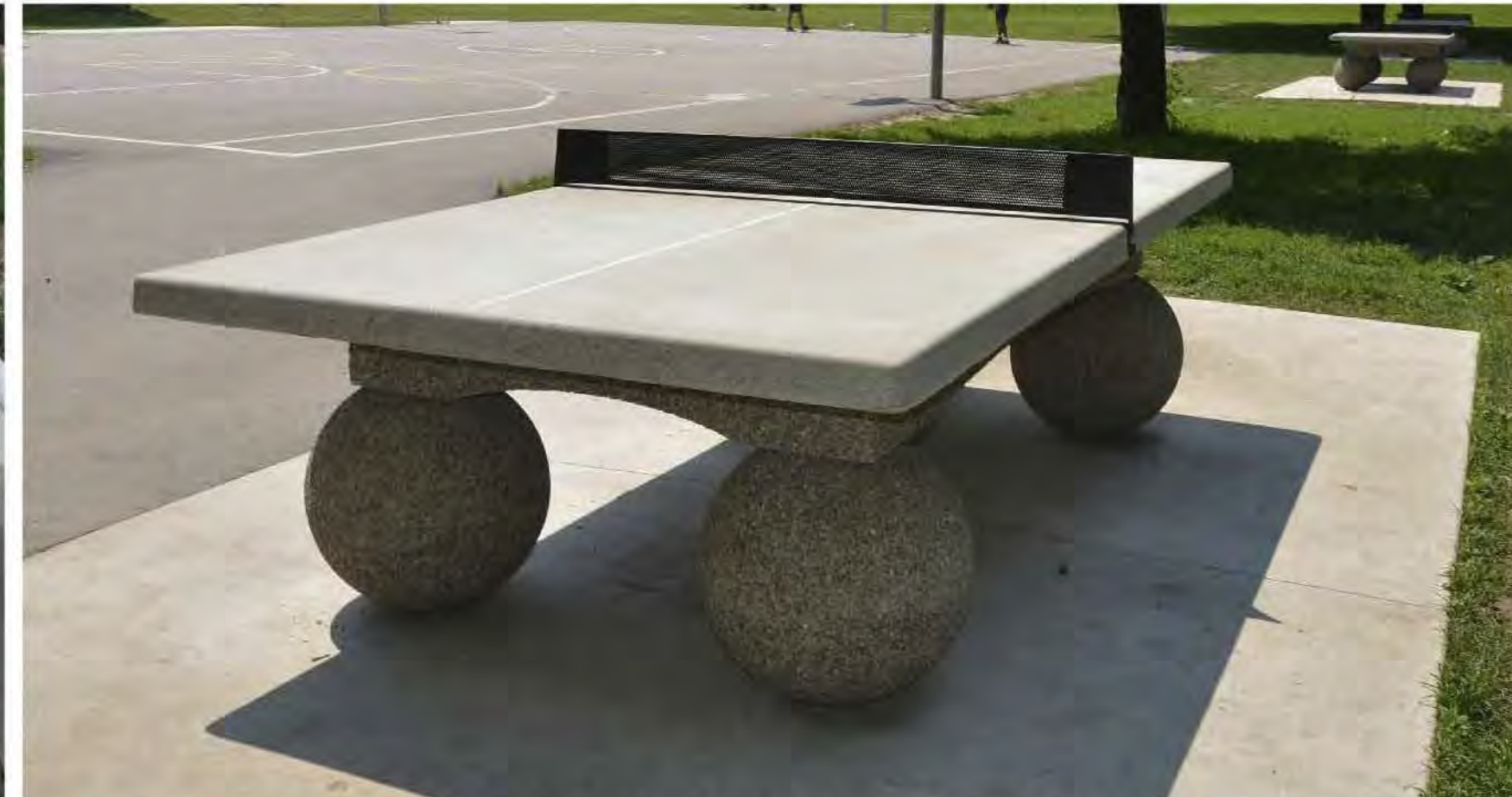
PRECAST CONCRETE PING PONG TABLE