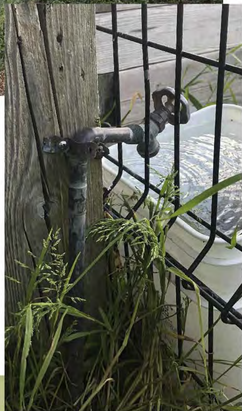
GARDEN HOSE BIB