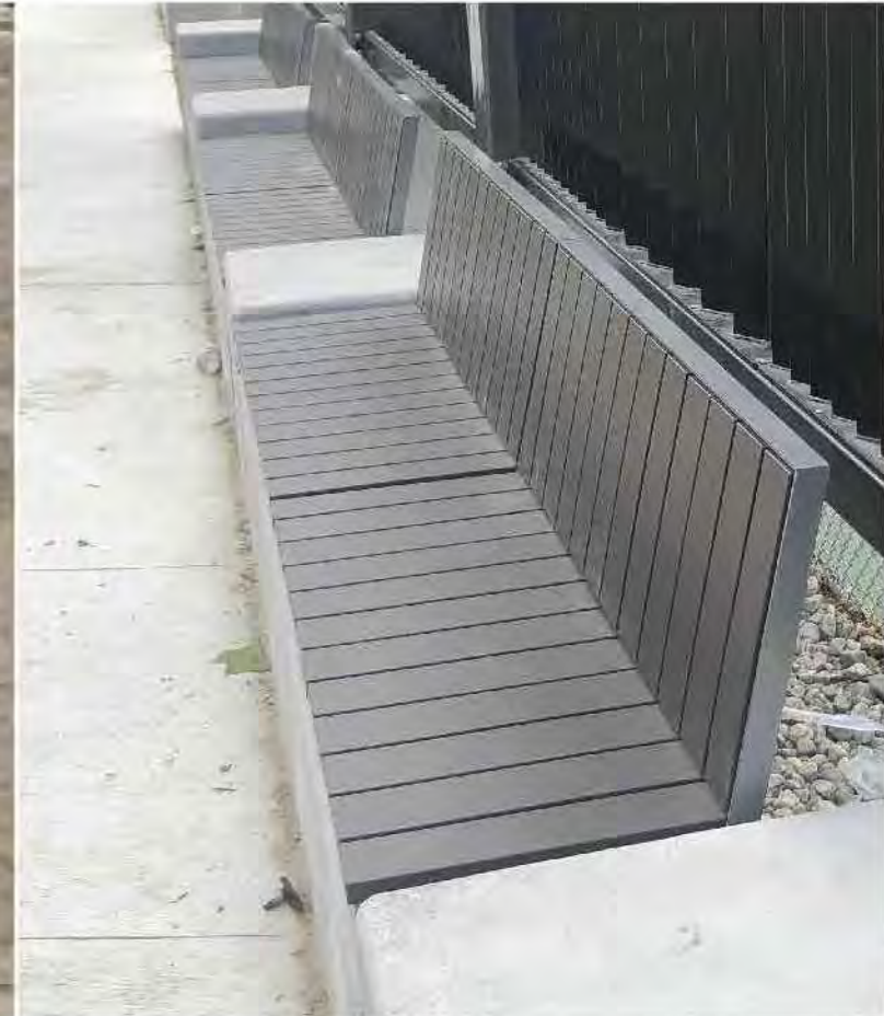
BACKED BENCH TOP ON LOW CONCRETE WALL