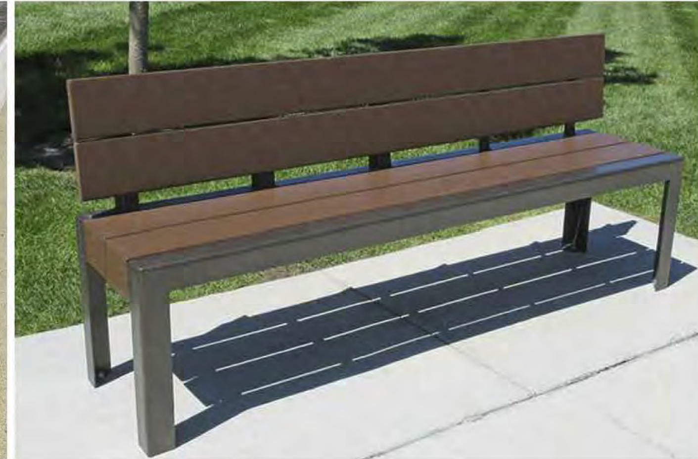
BENCH ON CONCRETE PAD