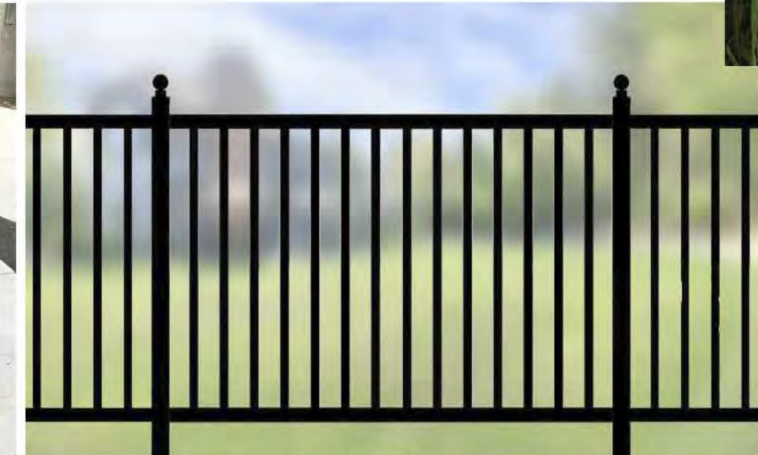
DECORATIVE METAL FENCE