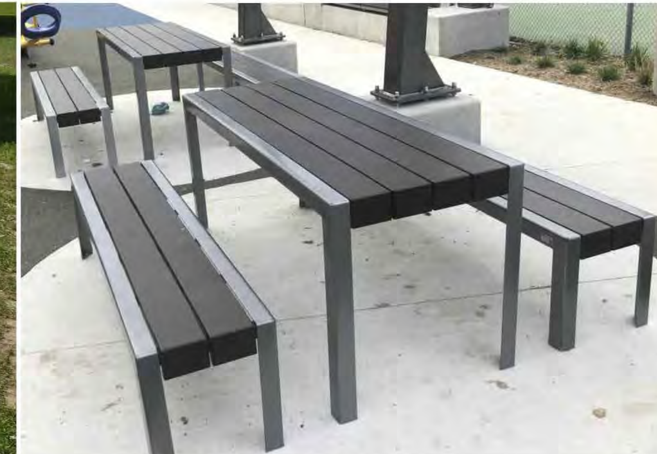
ACCESSIBLE PICNIC TABLE