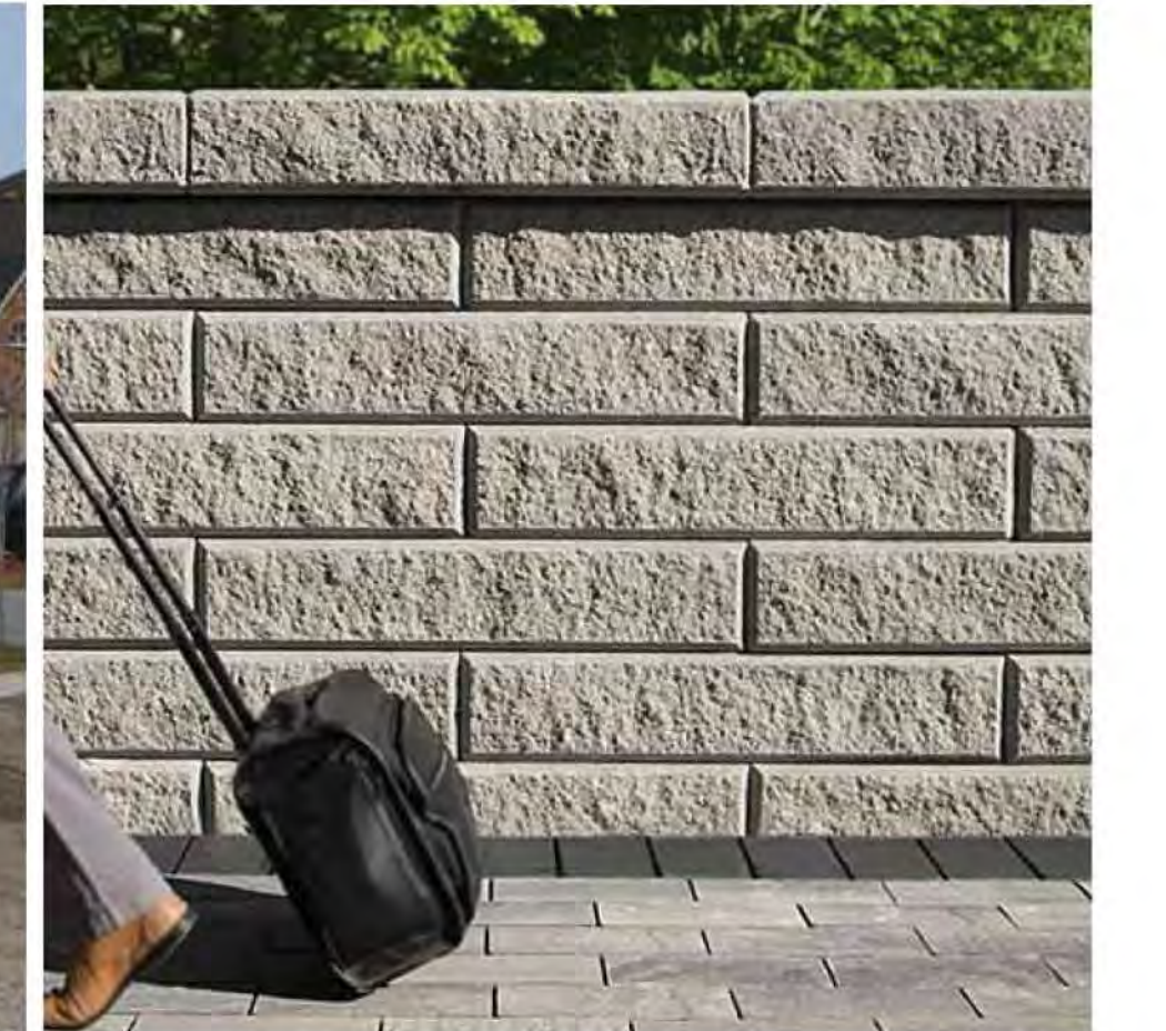
CONCRETE RETAINING WALL