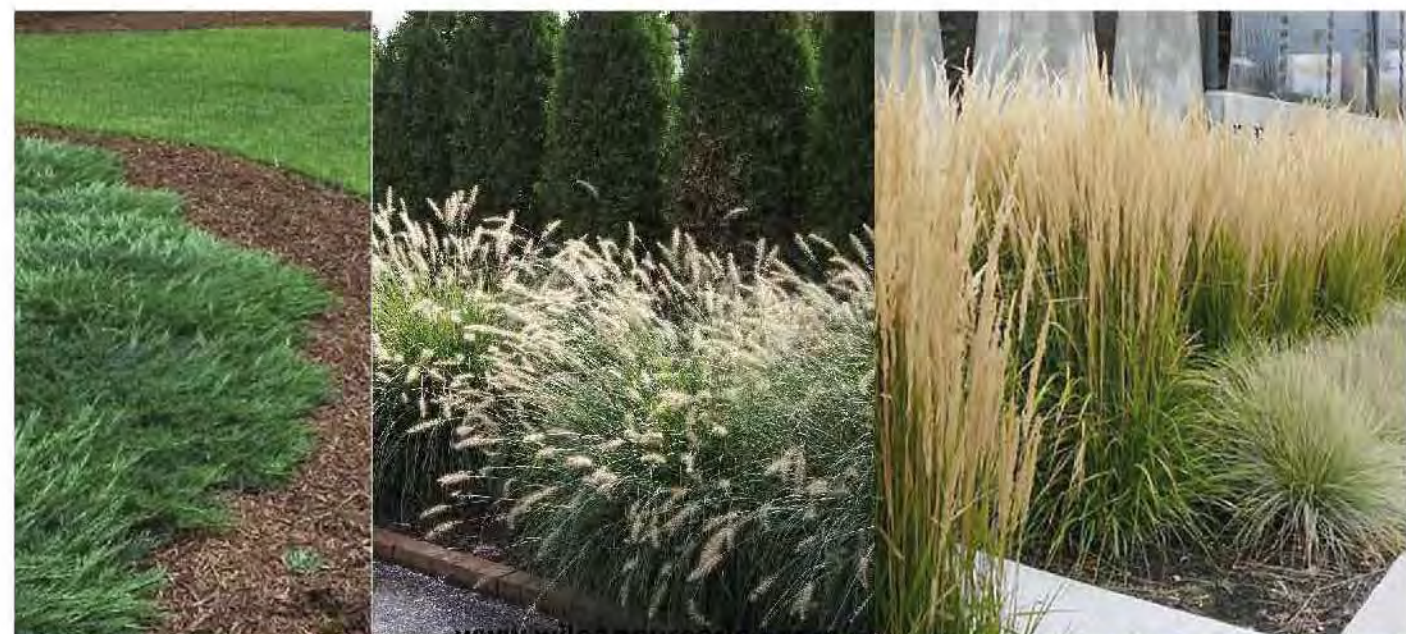
SHRUB BED (ORNAMENTAL PLANTINGS)