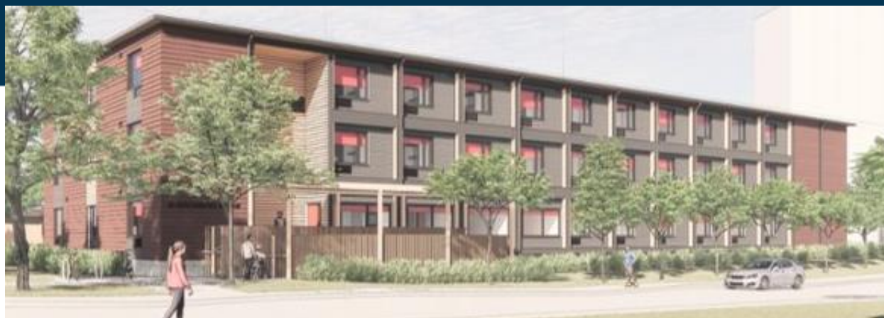
Revised artist's rendering, subject to final approval.