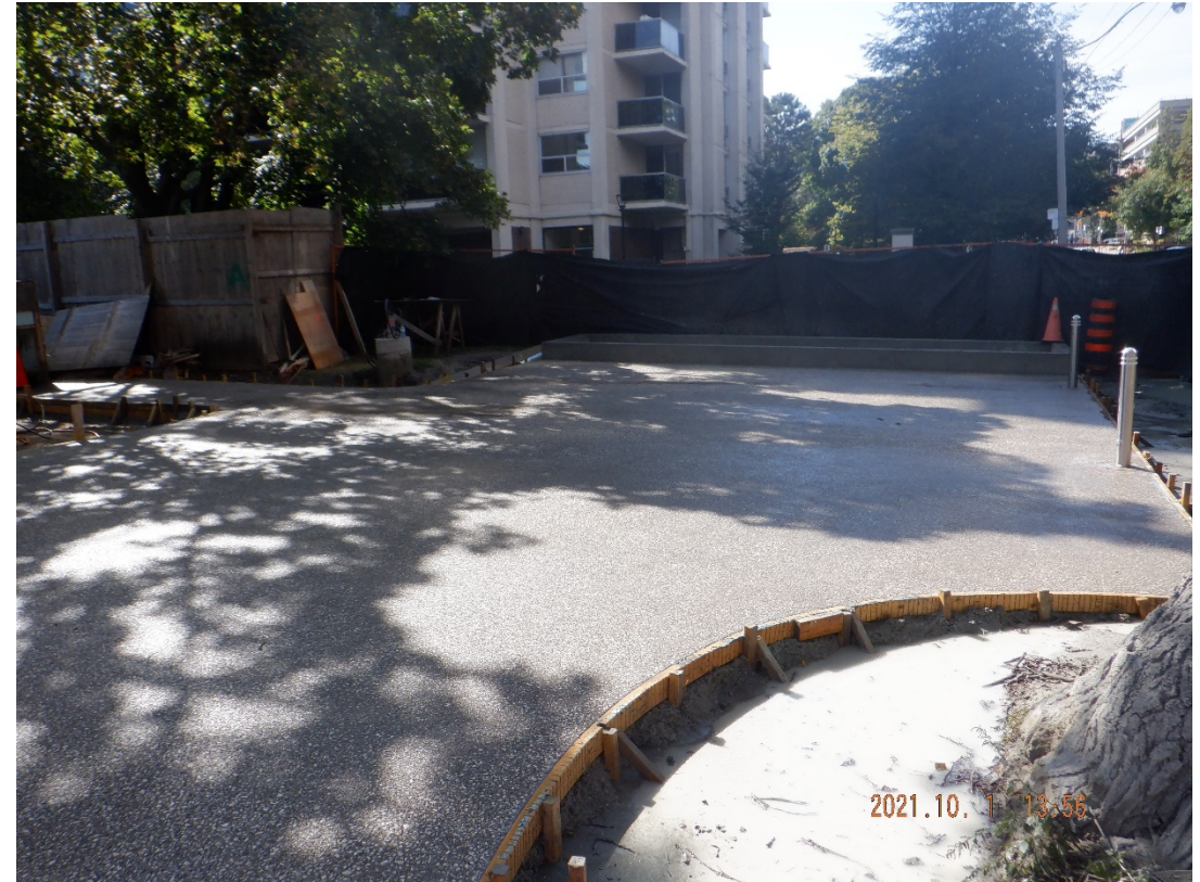
North-west corner of the park (Rosehill node) concrete poured and finished.