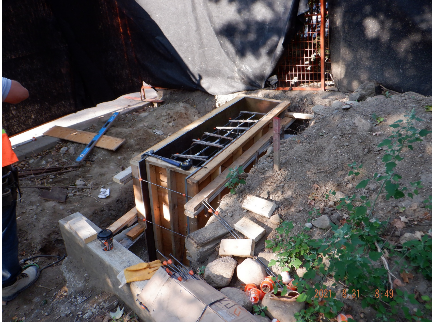
The footings for the community bulletin board located in Little Park/Summerhill Entrance