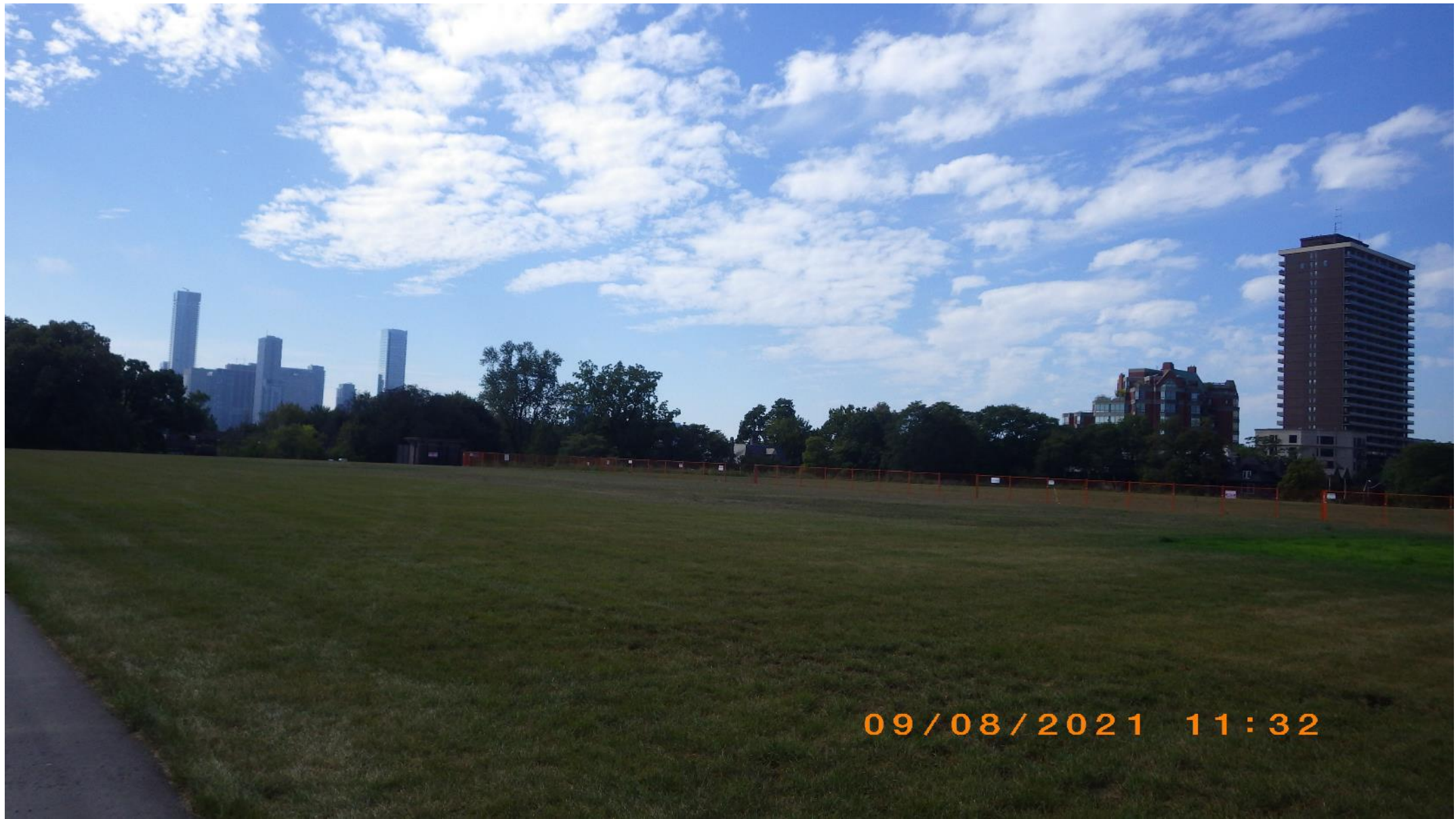
New sodding placed on plateau (East side of park, looking southwest)