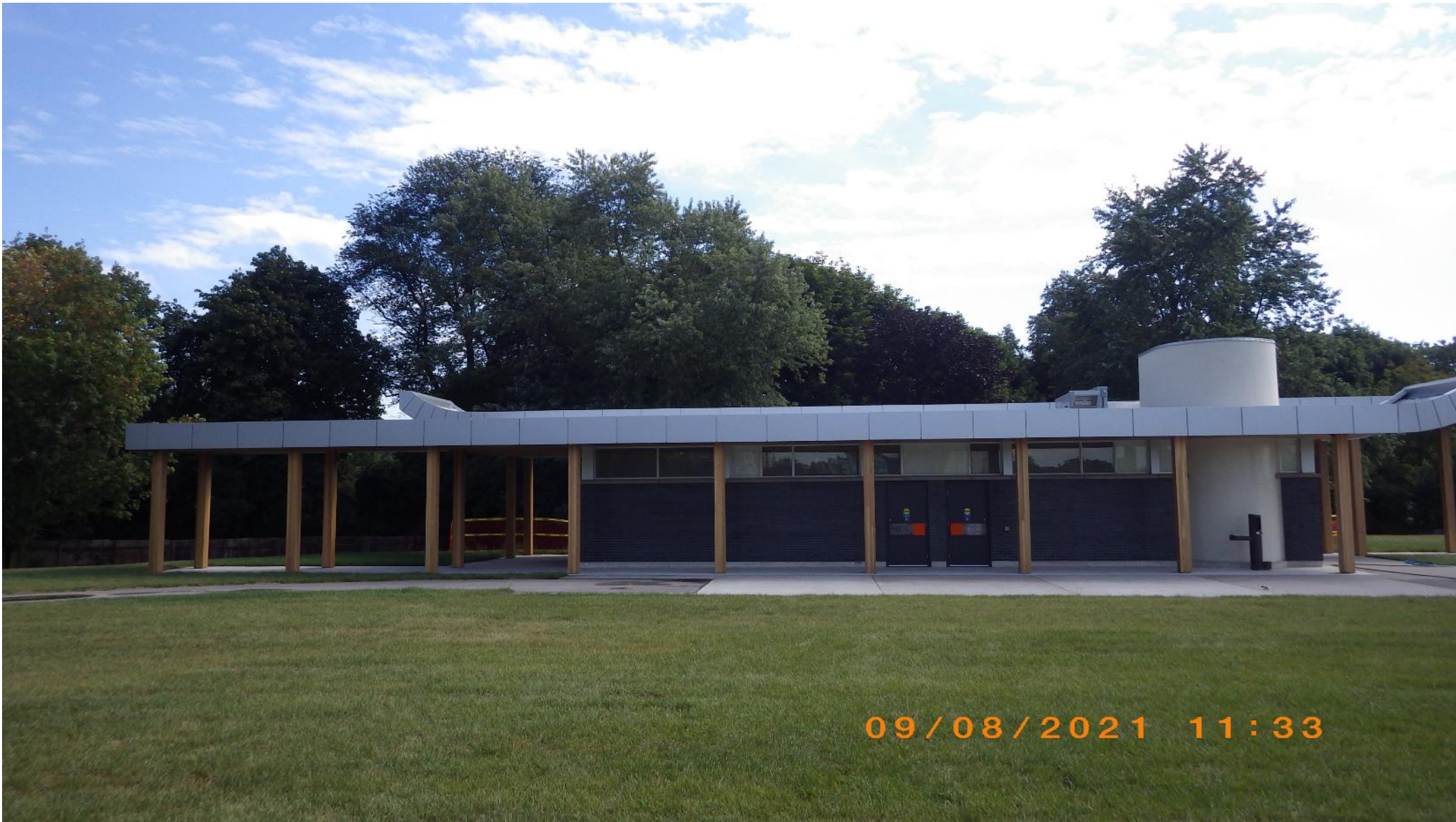
Washroom completed (looking east)