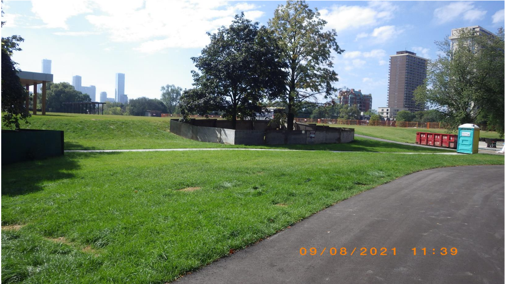
Avoca Parks Yard – newly paved driveway at the front of photo (Near the Avoca Node, looking southwest)