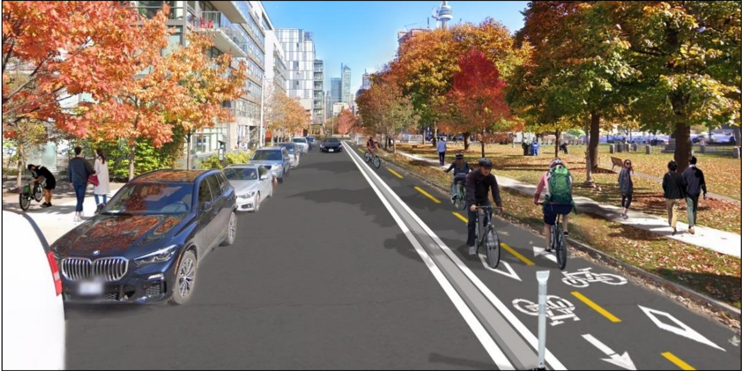
The above is an artist rendering of Wellington Street adjacent to Victoria Memorial Park looking east.