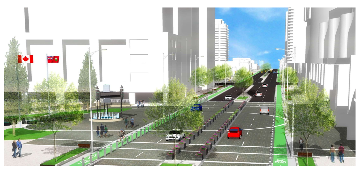
Exhibit ES-4: Mel Lastman Square

The plan includes improvements to the public realm at Mel Lastman Square (shown below in Exhibit ES-4 ). Community events that showcase music, art, dancing, theatre, food, and sports are held at the Square year-round. This public function often requires the street to be closed off in its vicinity which suggests a natural need for integration with the streetscape and the public realm across the right-of-way.