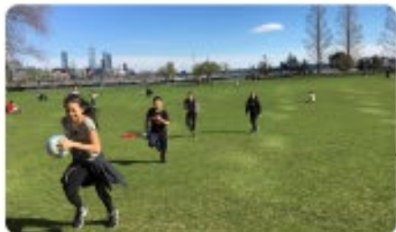
Open Lawn / Open Play Area