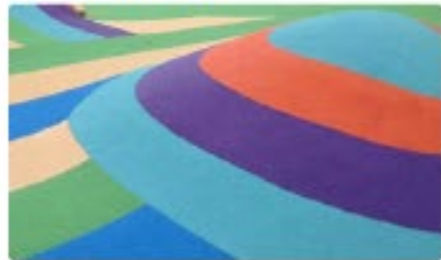
Colourful Rubberized Play Surface