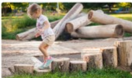
Log Play Area