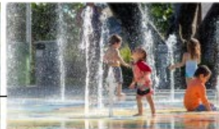
Splash Pad / Water Play