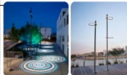
Sculptural Light Fixtures