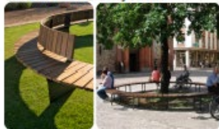
Circular Wood Bench