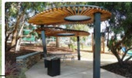
Sculptural Canopy Features