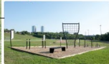
Outdoor Fitness Area