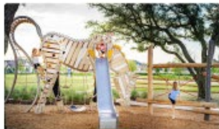
Sculptural Play Features