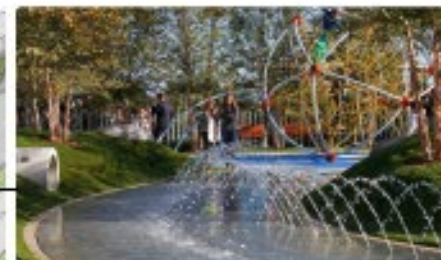
Animated Water Play Area