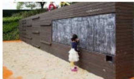
Interactive Feature Wall