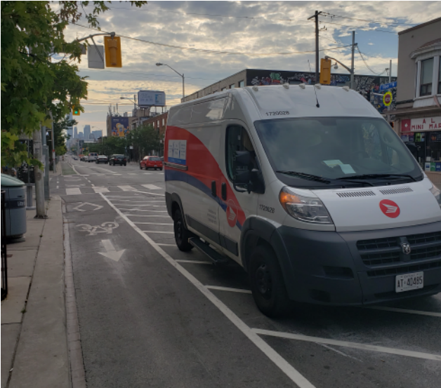
Buffer loading on far side of intersection