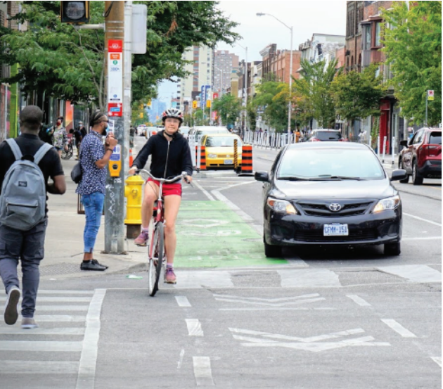
Car yielding to bikes at right turn