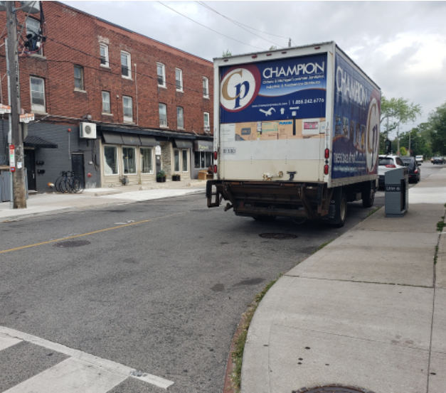
Side street loading