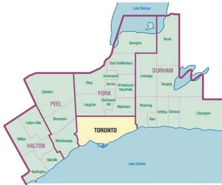
Figure 1: Map of the Greater Toronto Area

Organizations included in this directory are located generally within the Greater Toronto Area (GTA). This helps capture local supply chain linkages between organizations and to include the travel patterns that Toronto residents might cover for employment and the purchasing of services and products. The geographic parameters of the GTA best captures these travel patterns and reflect a more cohesive group of green businesses operating in and serving the areas where Toronto residents live and interact.