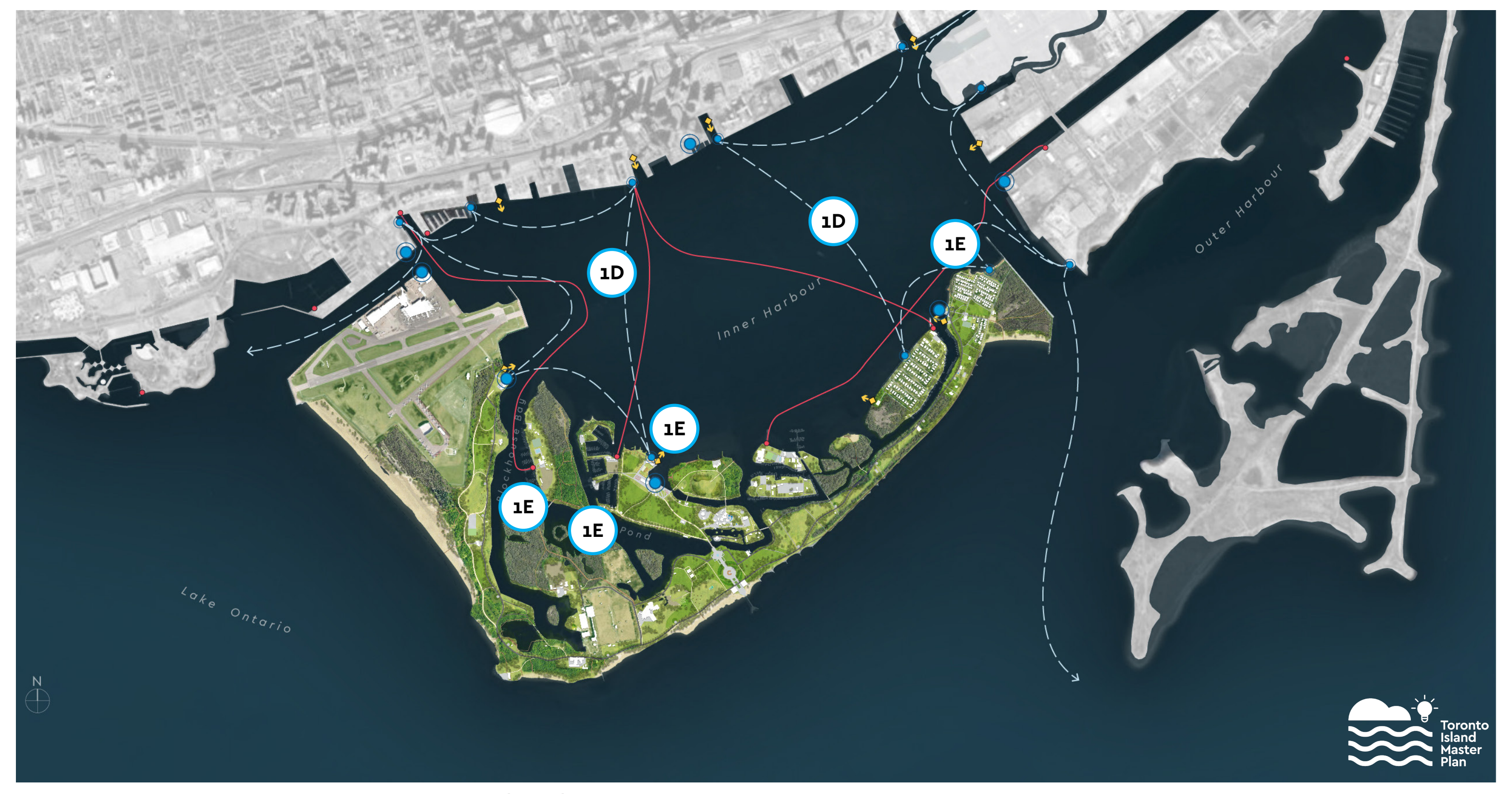
MAP ACC-02: Improving Access and Connection - Shuttle / Taxi / Tender