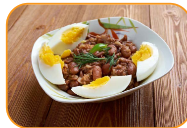
Ful mudammas with eggs