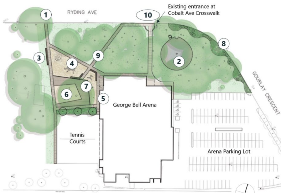
Image 3 Geometric Park Design Option