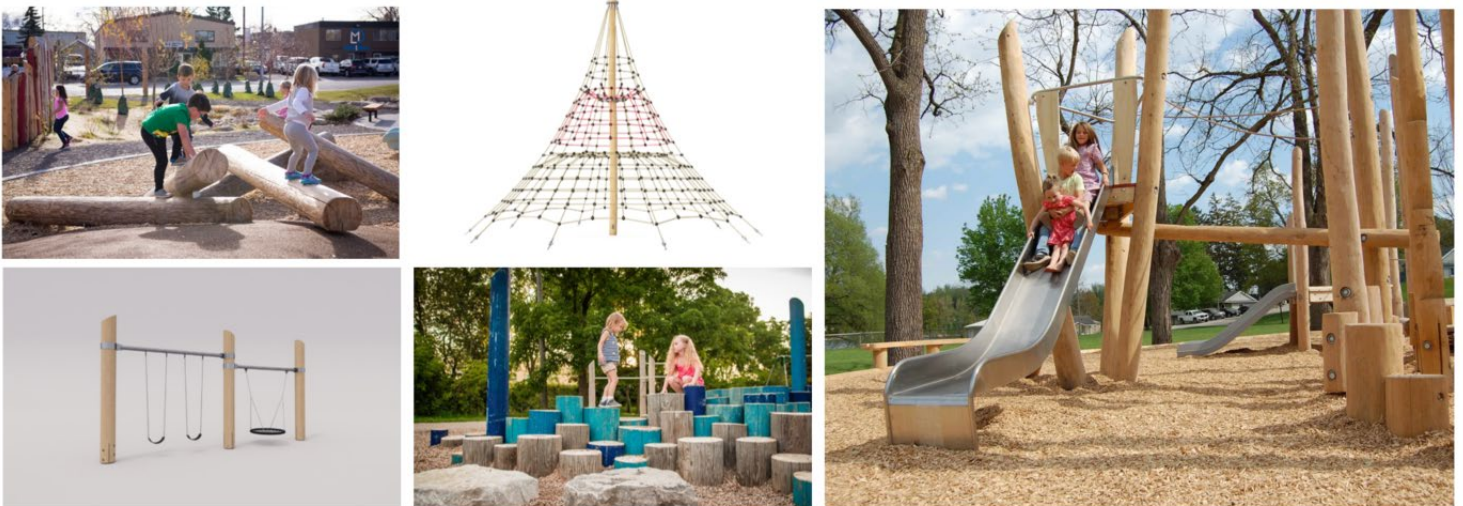
Image 5 Modern play equipment

Nature-inspired playground design, with a focus on incorporating natural materials.