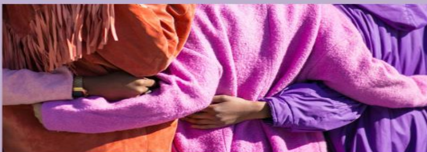
The picture shows the backs of three youth with their arms around each other.