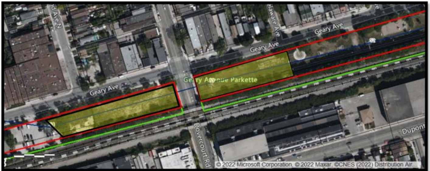
Figure 2- Licensed Area Sketch