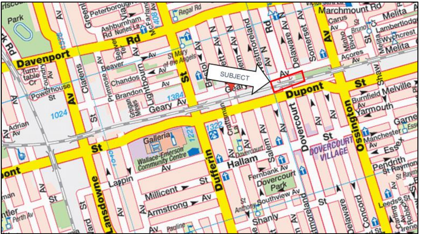
Figure 1 - Location Map