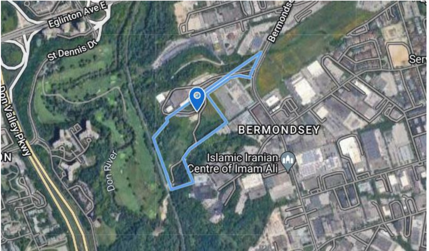
Figure 1 – Location Map