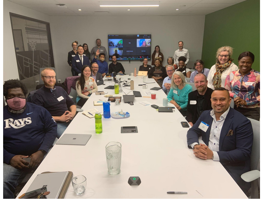
CAG members and City staff at the December 2022 meeting