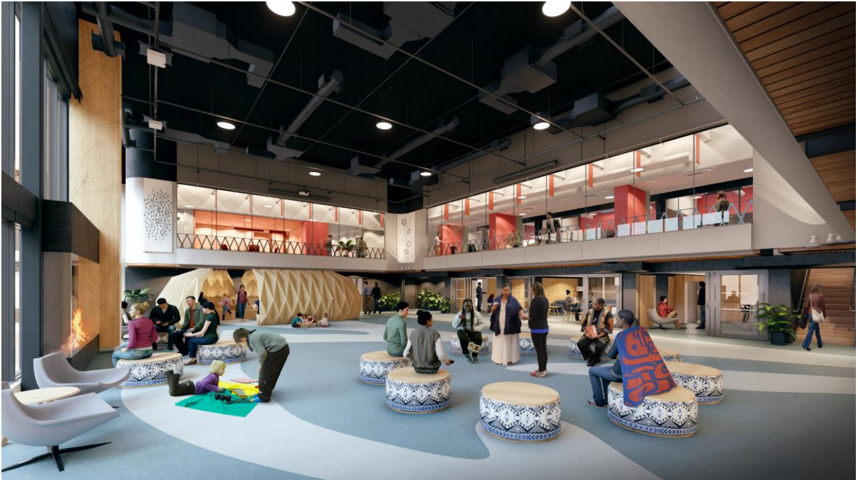
Second Floor Artist Rendering