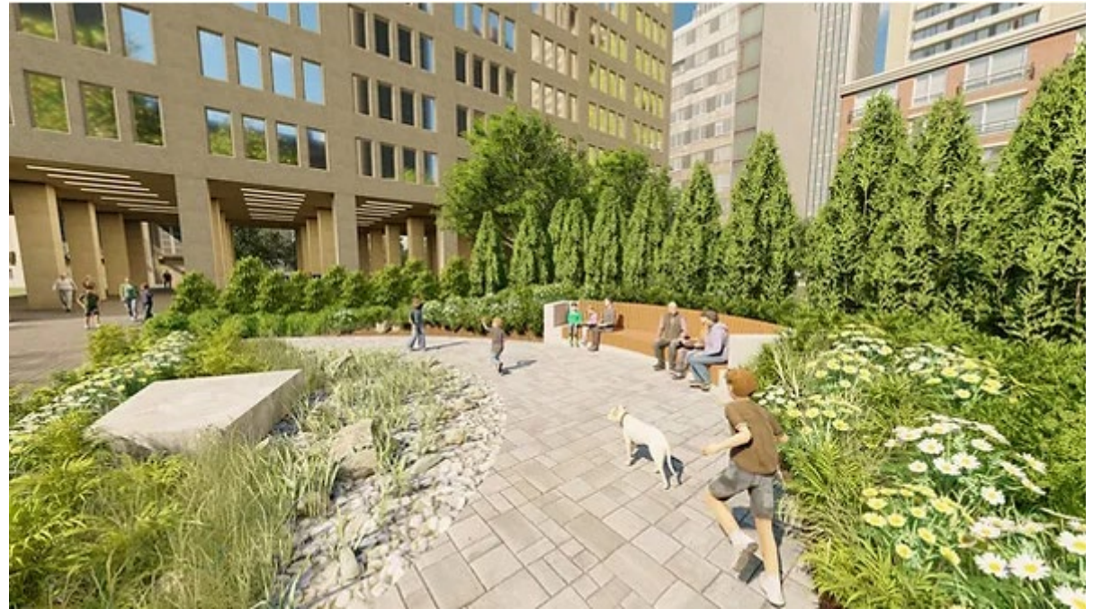
Macdonald Block Loop - Indigenous Ceremonial Garden, near Bay and Wellesley streets, Two Row Architect with adesso design inc., expected completion 2024 (image: Two Row Architect)

“In consultation with Indigenous communities and nations and the Aboriginal Affairs Advisory Committee, prioritize the creation of spaces appropriate for Indigenous cultural and ceremonial practices in Bellevue Square Park and Sonya’s Park.”