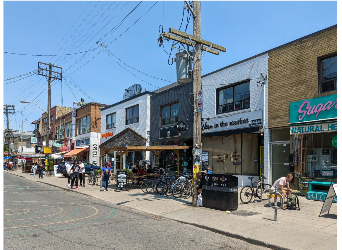
Augusta Avenue, north of Nassau Street looking northeast