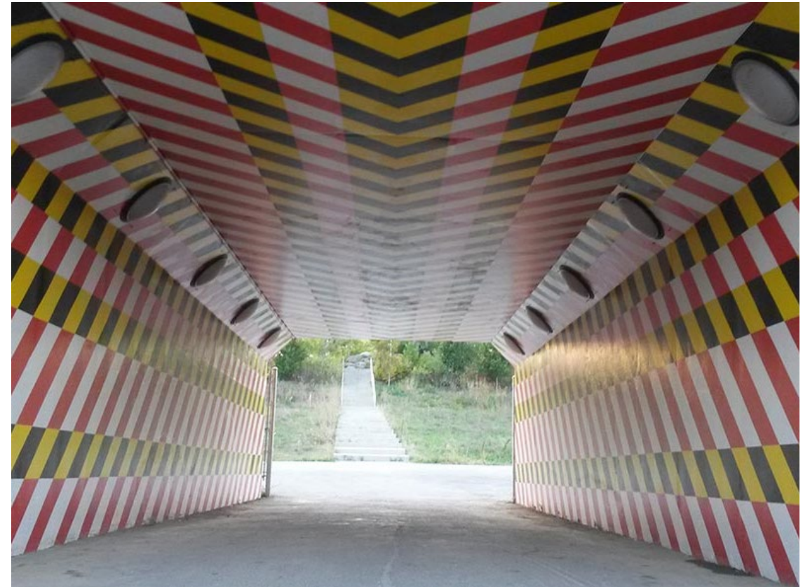
Bala Underpass , Lower Don River Trail, Rolande Souliere, 2015

“Honour and recognize special events, such as National Indigenous Peoples Day, as part of the gateway treatments.” (in West Queen West HCD Plan)