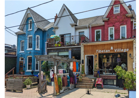
2-6 Kensington Avenue