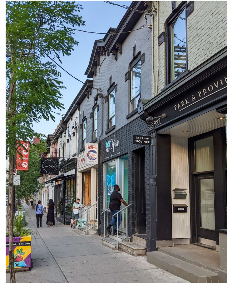
South side of Queen Street West, looking east near Strachan Avenue

Planning tool that ensures ongoing change conserves and maintains cultural heritage value