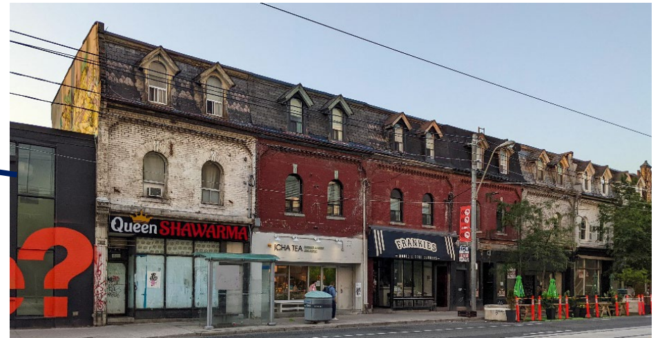
North side of Queen Street West, east of Ossington Avenue