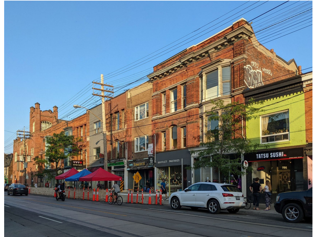
Queen Street West, looking southeast near Manning Avenue

The purpose of this engagement session is to review proposed policies and guidelines for the Kensington Market and West Queen West Heritage Conservation Districts