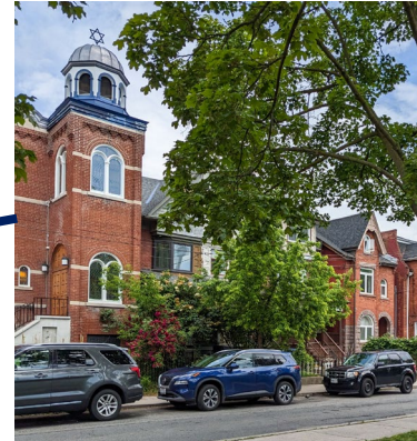
20-28 Denison Square