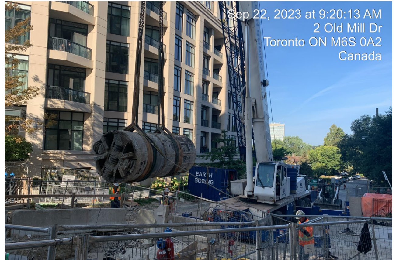
On Friday, September 22, 2023, MTBM's head retrieval operation.