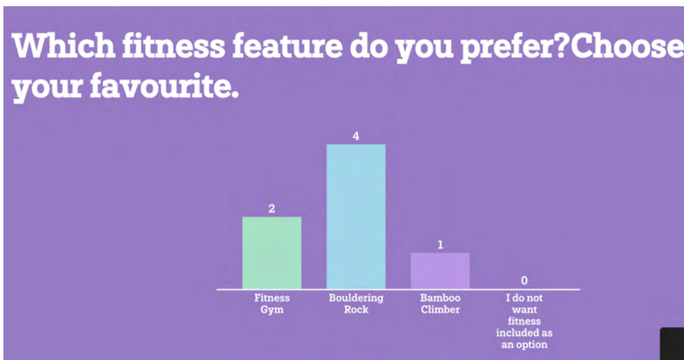
Response screen on Mentimeter once participants had indicated their preference for Fitness Features.