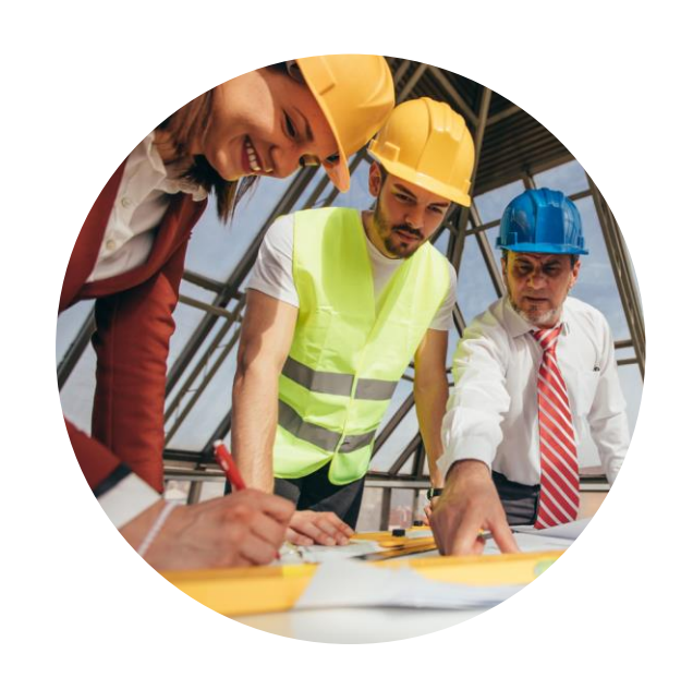
One-on-one energy coaching throughout for support and guidance.