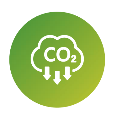
Reduce environmental impact