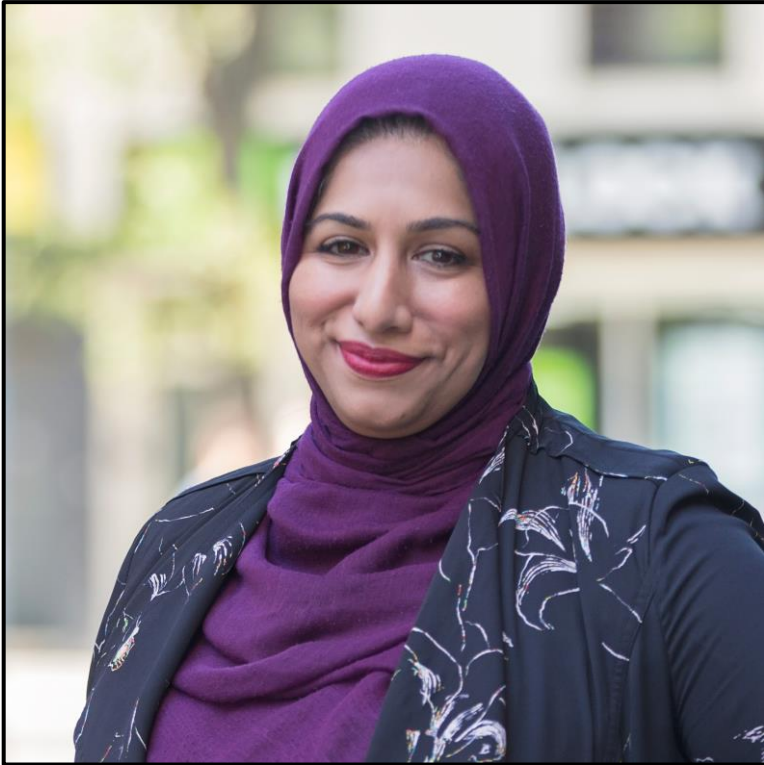
Deputy Mayor Ausma Malik Spadina-Fort York