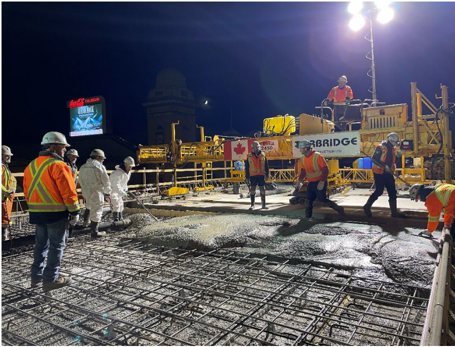
Concrete deck pour continues at a segment of phase 1.