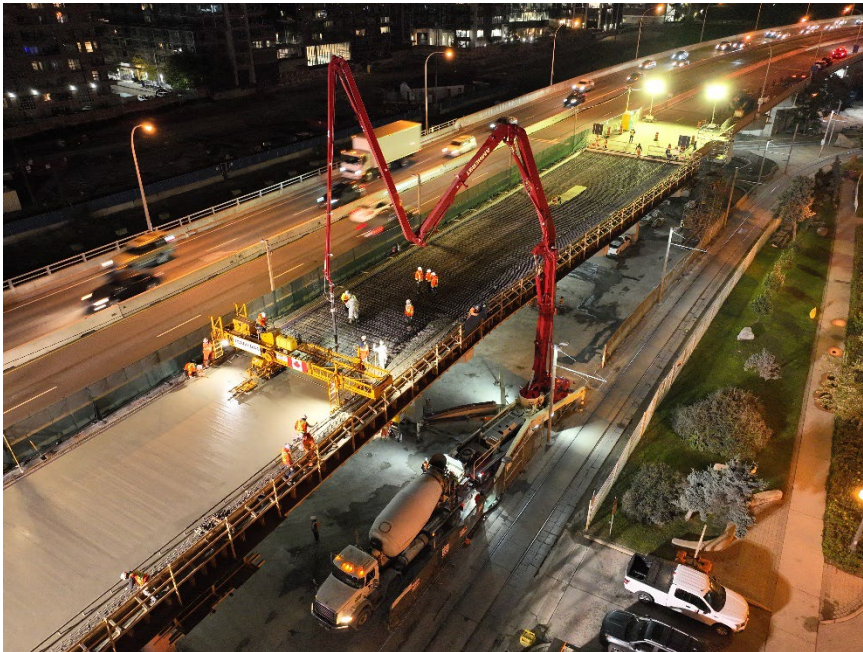
Aerial shot of a large crane pumping concrete to the segment of rebar.