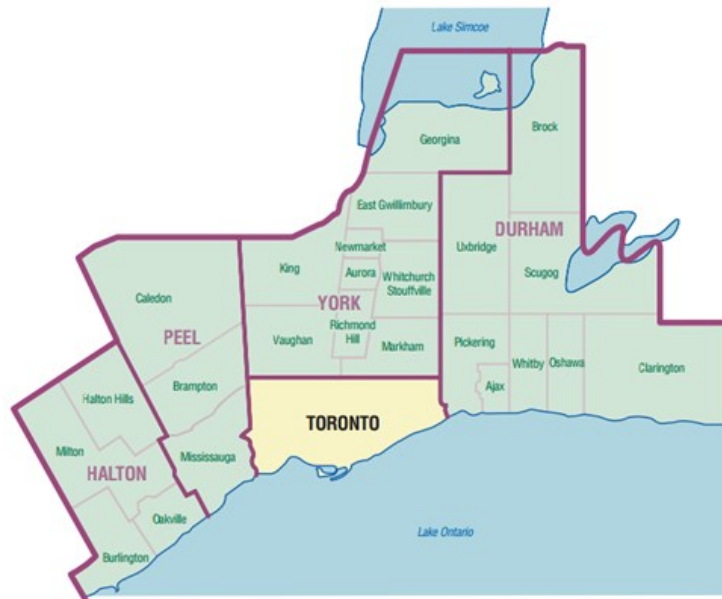
Figure 1: Map of the Greater Toronto Area

Organizations included in this directory are located generally within the Greater Toronto Area (GTA). This helps capture local supply chain linkages between organizations and includes the area that Toronto residents might travel for employment and the purchasing of goods and services. The geographic parameters of the GTA best captures these travel patterns and reflect a more cohesive group of green businesses operating in and serving the areas where Toronto residents live and interact.