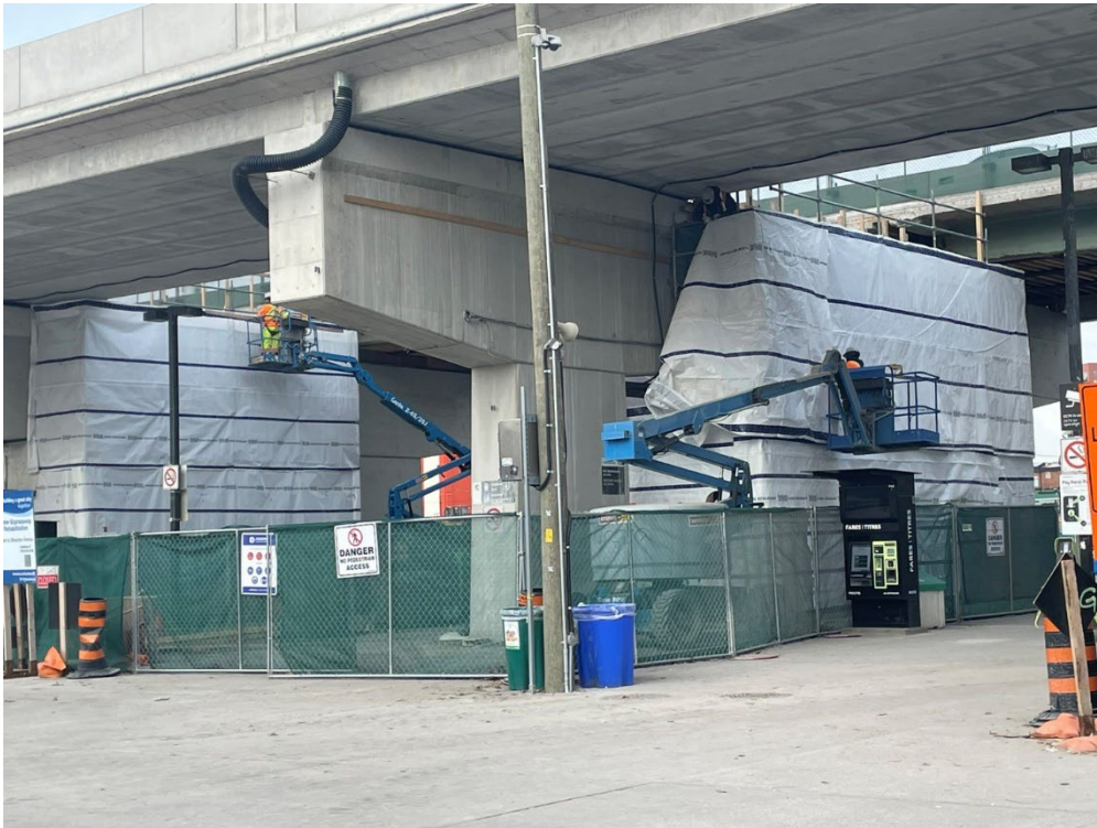
Crews setting up the tent enclosure to protect the concrete during cold weather conditions, while the concrete cures. Scaffolding (support system for formwork) for bent cap reconstruction is ongoing.