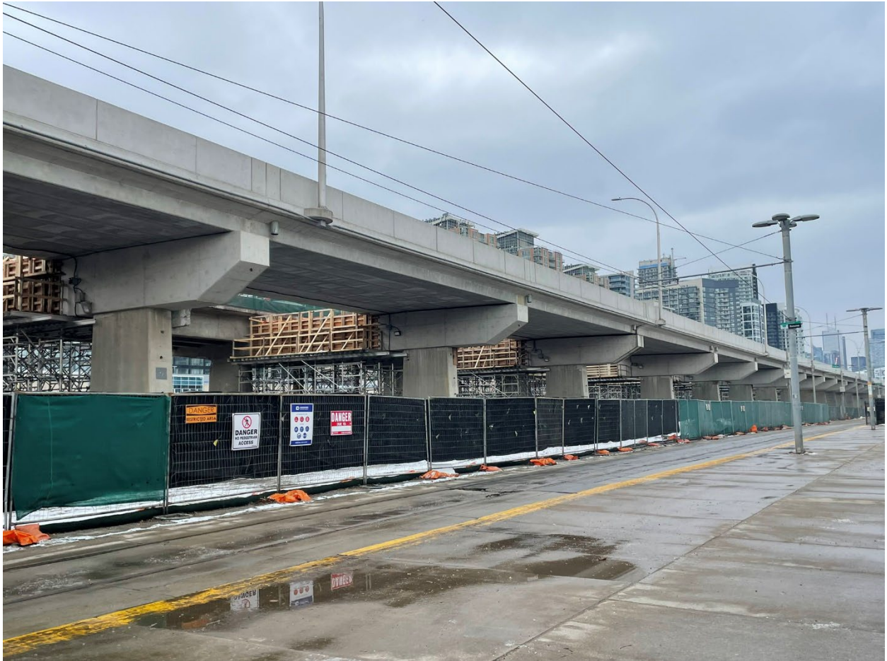
Completed bridge deck from the west side looking east.

Visual Work on Site: The images below describe the type of work occurring on site during the week of January 13 th , 2025.