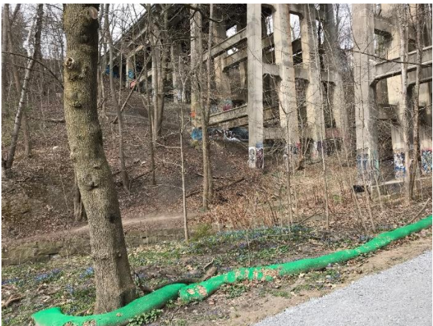
Plate 17: Valley under rail corridor; Area is disturbed and sloped, no potential