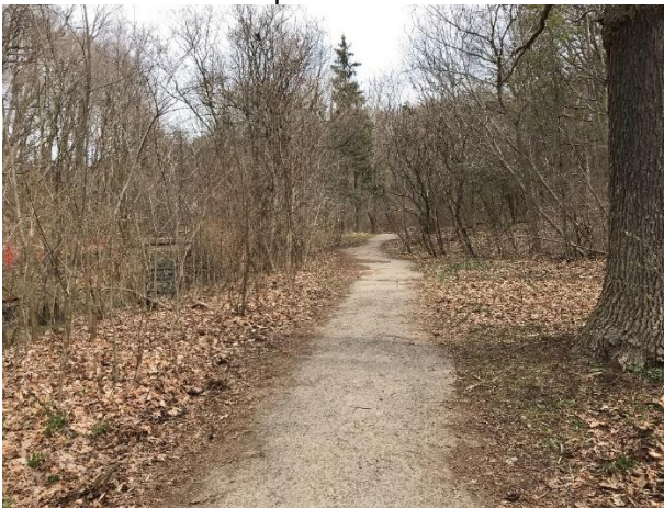
Plate 13: Valley floor; Area requires test pit survey