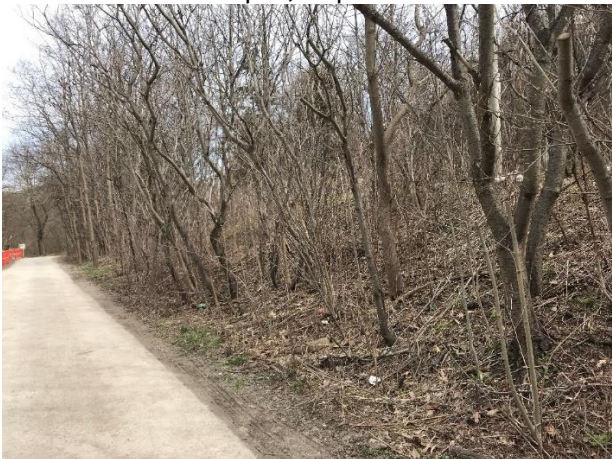
Plate 19: View of valley and trail; Area is sloped, no potential