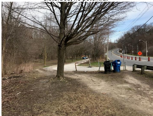
Plate 22: Mount Pleasant Road entrance and buried creek; Area is disturbed, no potential