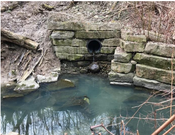
Plate 7: View of outfall; Area is disturbed, no potential