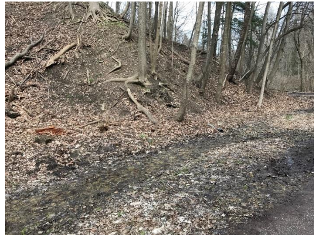
Plate 12: Valley and trail; Area up to bottom of slope requires Stage 2 survey