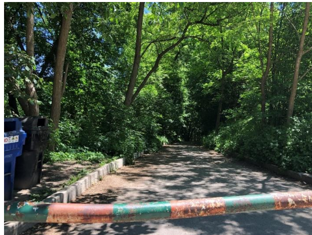
Plate 8: Avoca Ave Trail access; Area is disturbed, no potential