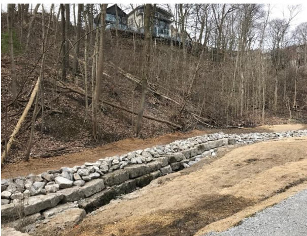
Plate 15: View of channelized creek and valley sides; Area is disturbed and sloped, no potential