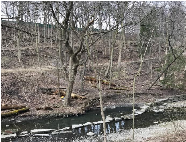
Plate 11: Channelized creek and erosion control measures; Area is sloped and disturbed, no potential