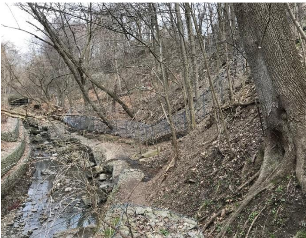
Plate 5: View of channelized creek and erosion control measures; Area is disturbed and sloped, no potential