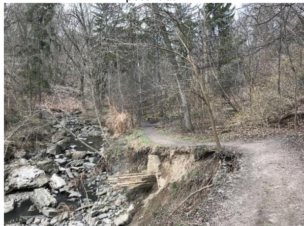
Plate 10: Eroding bank and trail; valley has complex potential and requires Stage 2 survey in some areas