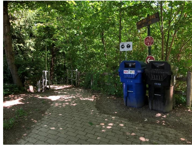
Plate 2: Heath Street trail access; Area is sloped and disturbed, no potential