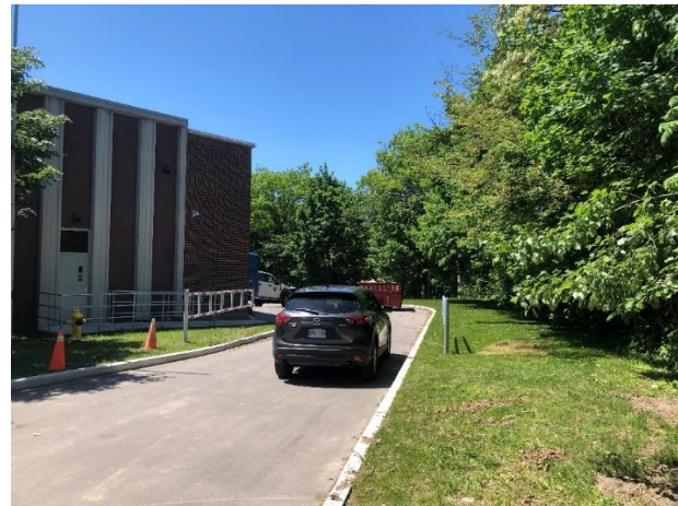
Plate 14: Rosehill Pumping Station and David Balfour Park; Area is disturbed, no potential