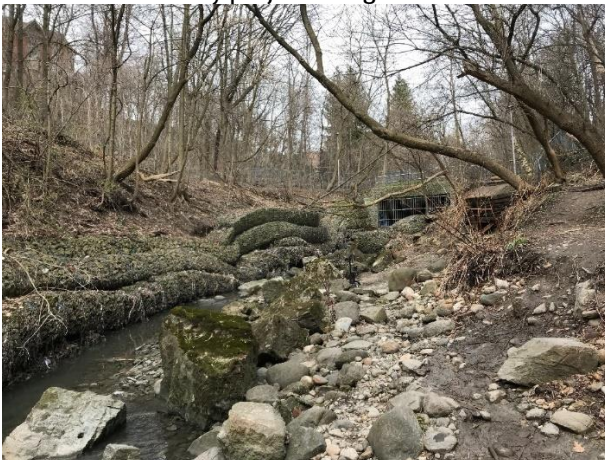
Plate 3: View of channelized creek and erosion control measures; Area is disturbed, no potential