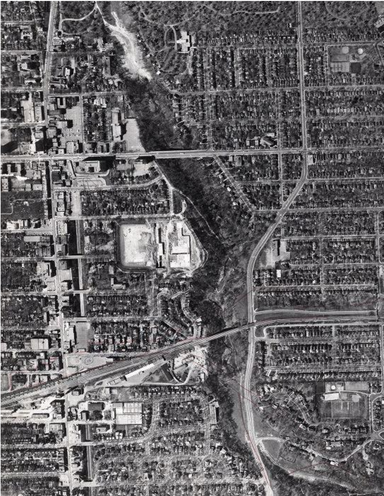
Image 4: 1964 Yellow Creek from Mount Pleasant Cemetery to Roxborough St E