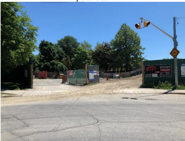
Plate 9: Entrance to David Balfour Park/Rosehill Reservoir; Area is disturbed, no potential