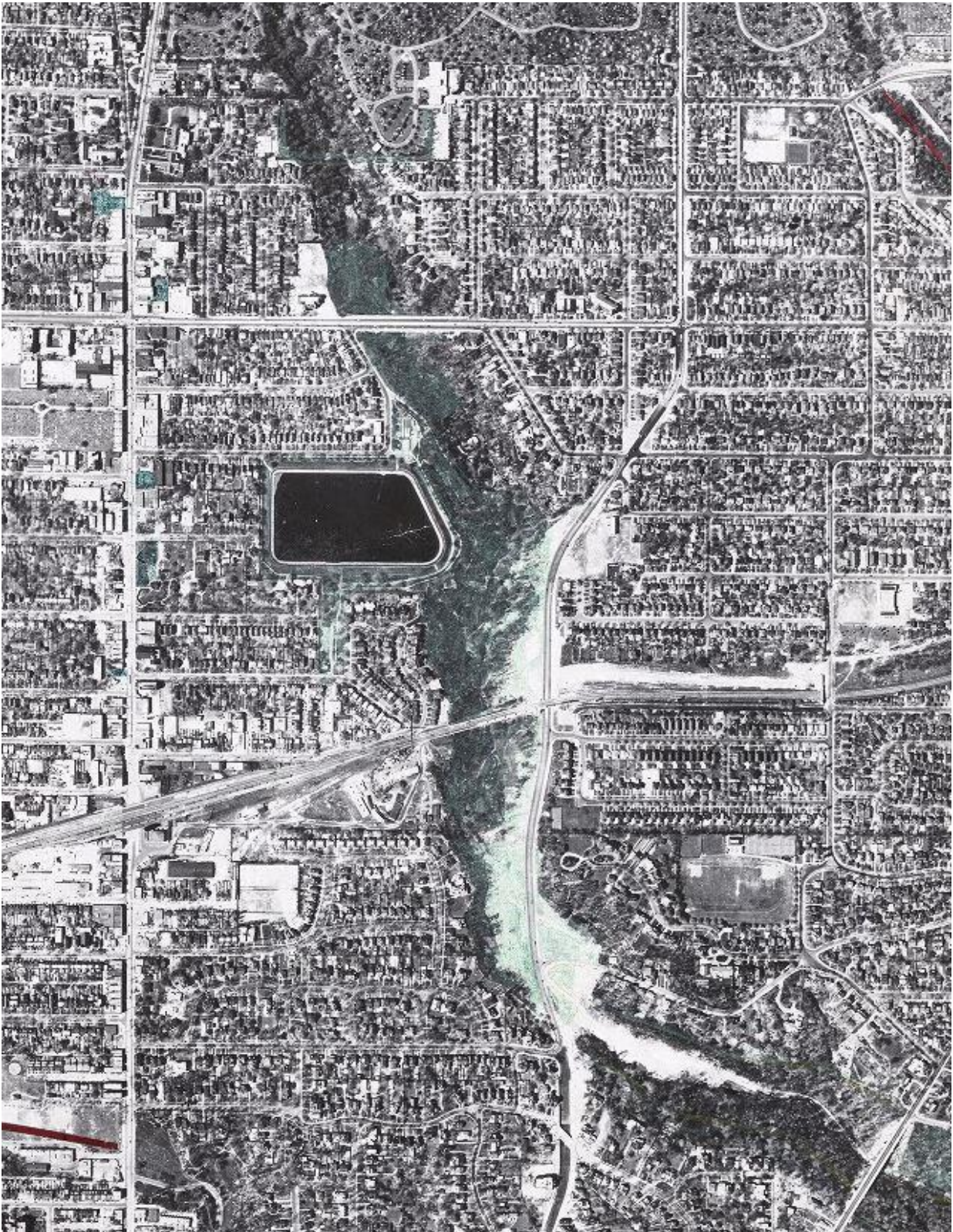
Image 3: 1950 Yellow Creek from Mount Pleasant Cemetery to Roxborough St E