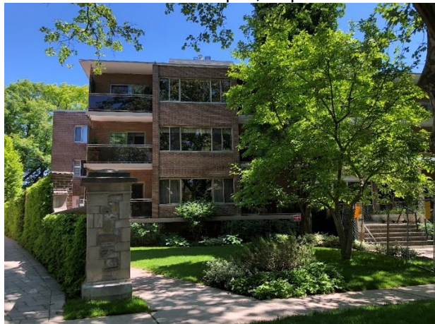
Plate 20: Thornwood Road apartments; Area is disturbed, no potential