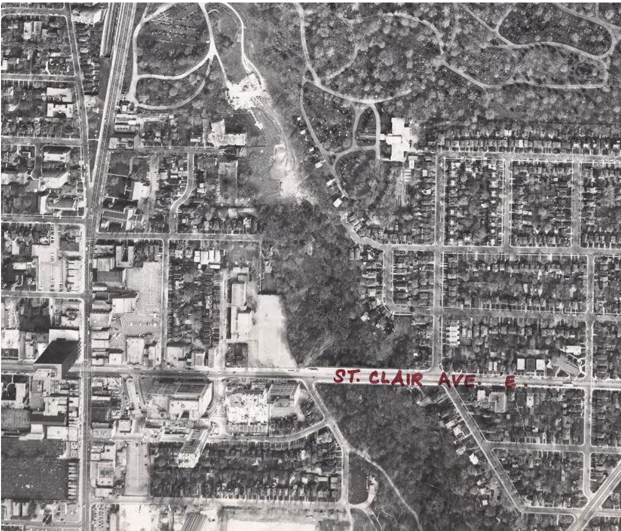
Image 5: 1966 Yellow Creek from Mount Pleasant Cemetery to Rosehill Avenue