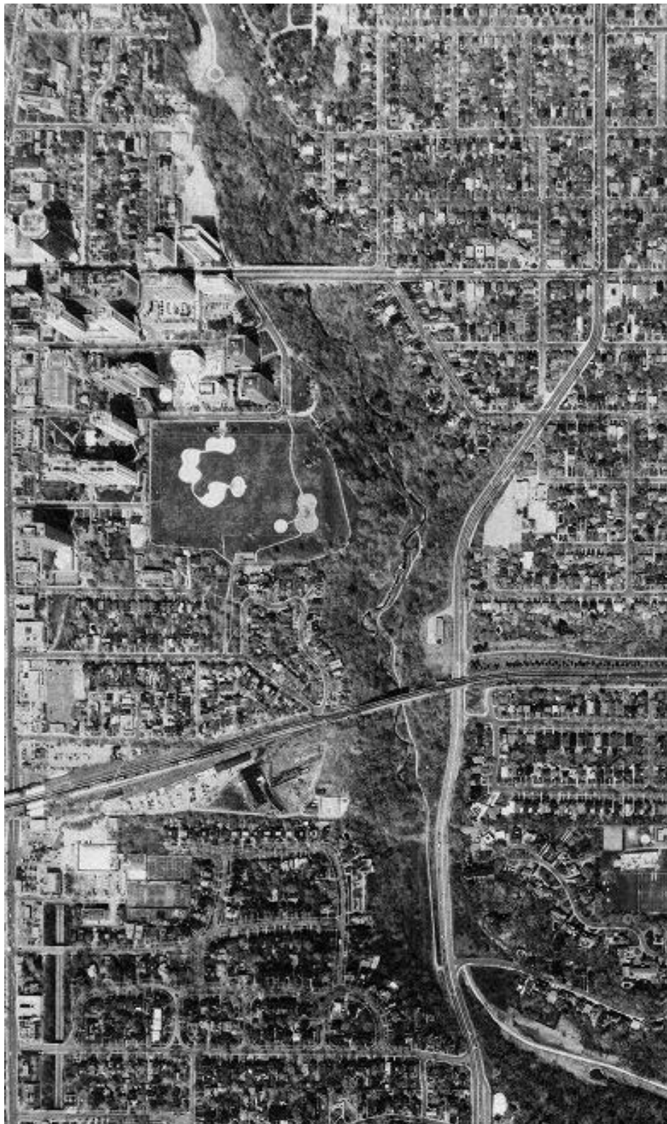
Image 7: 1983 Yellow Creek from Mount Pleasant Cemetery to Roxborough St E