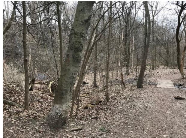
Plate 4: View of trail; Area requires test pit survey