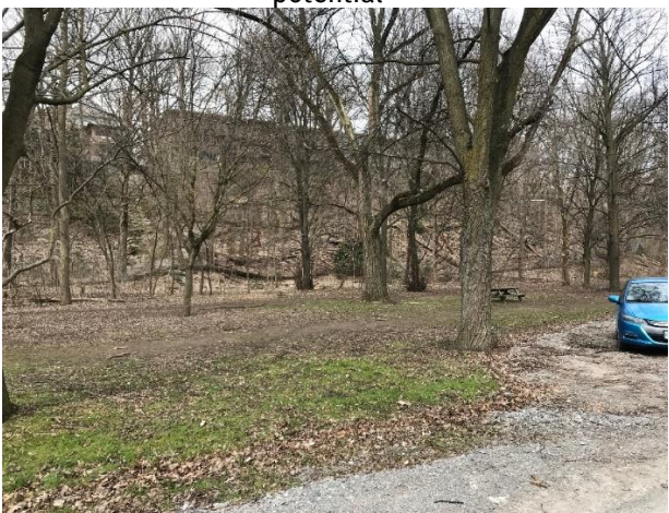
Plate 21: View of buried creek; Area is disturbed, no potential