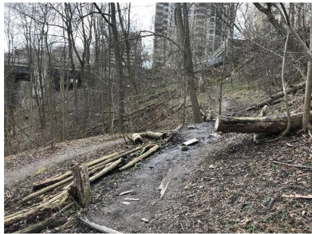
Plate 6: View of path to St. Clair Ave; Area is sloped, no potential