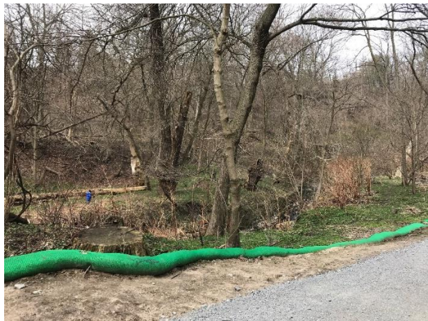
Plate 18: View of channelized creek and valley; Area is disturbed and sloped, no potential