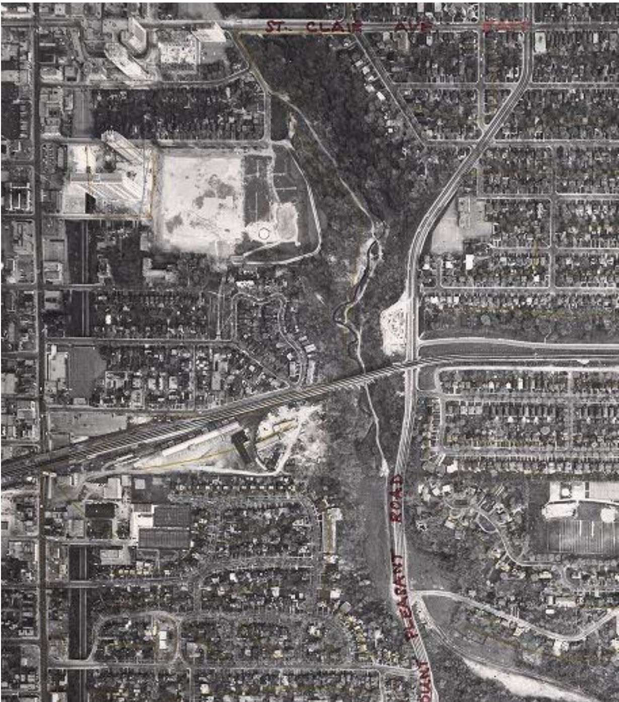
Image 6: 1966 Yellow Creek from St. Clair Ave to Roxborough Ave (City of Toronto Archives 2020b:1966-66)