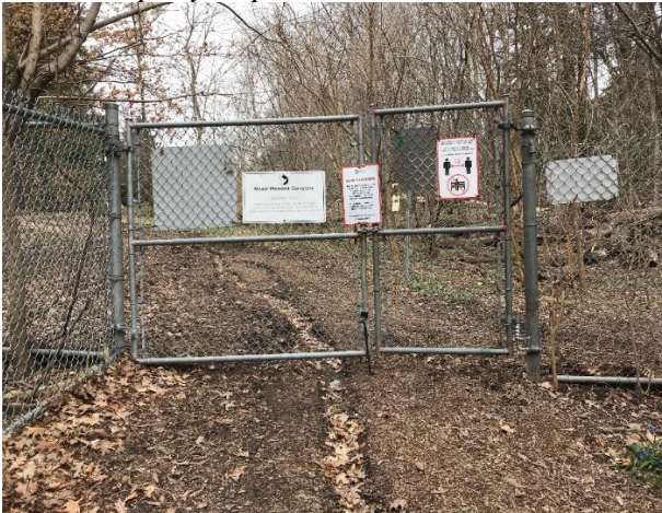
Plate 1: View of Mount Pleasant Cemetery access over buried creek; Cemetery lands must be avoided by project designs