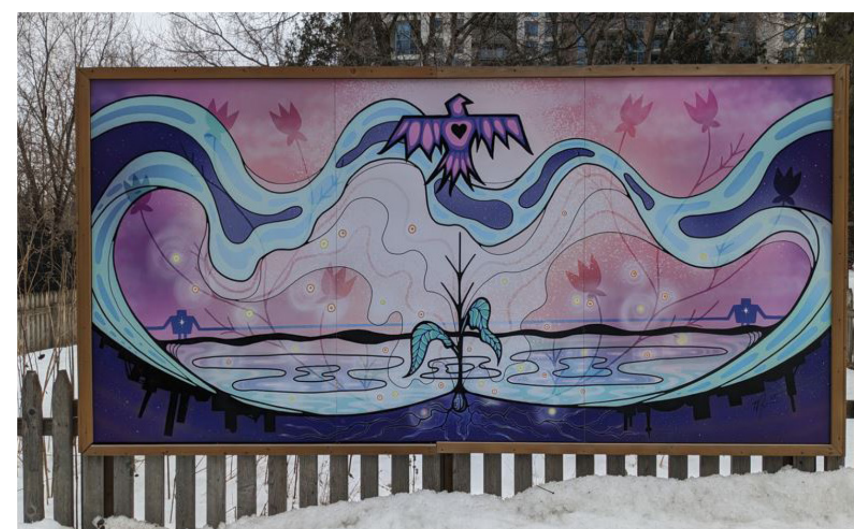
Figure 4: 2024 Art Connects Community Mural (North York Arts), “skyworld and beyond” by Indigenous artist Mo Thunder (City of Toronto)

What are your favourite stories and places in North York at the Centre?