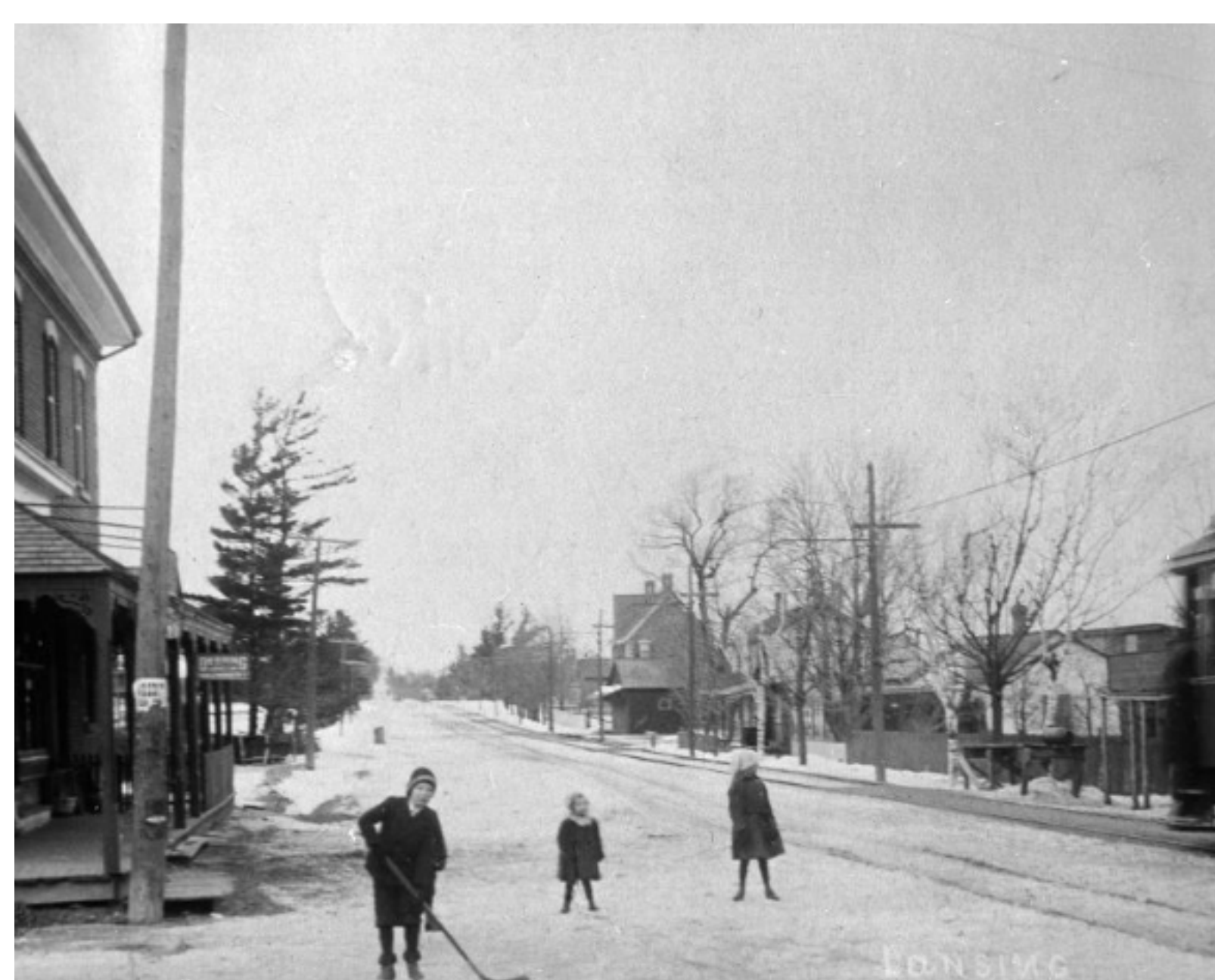
Figure 1: 1911 Dempsey Store at Yonge St & Sheppard Ave