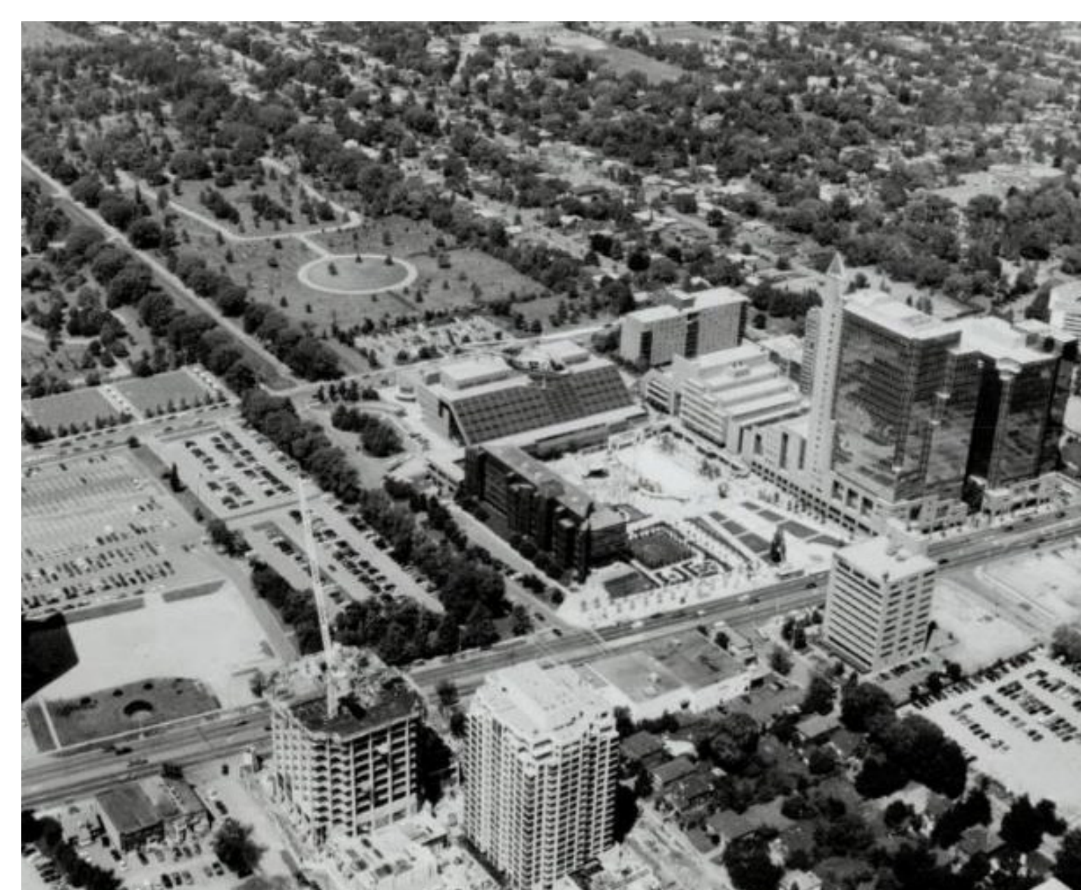
Figure 2: 1990 Civic Centre area