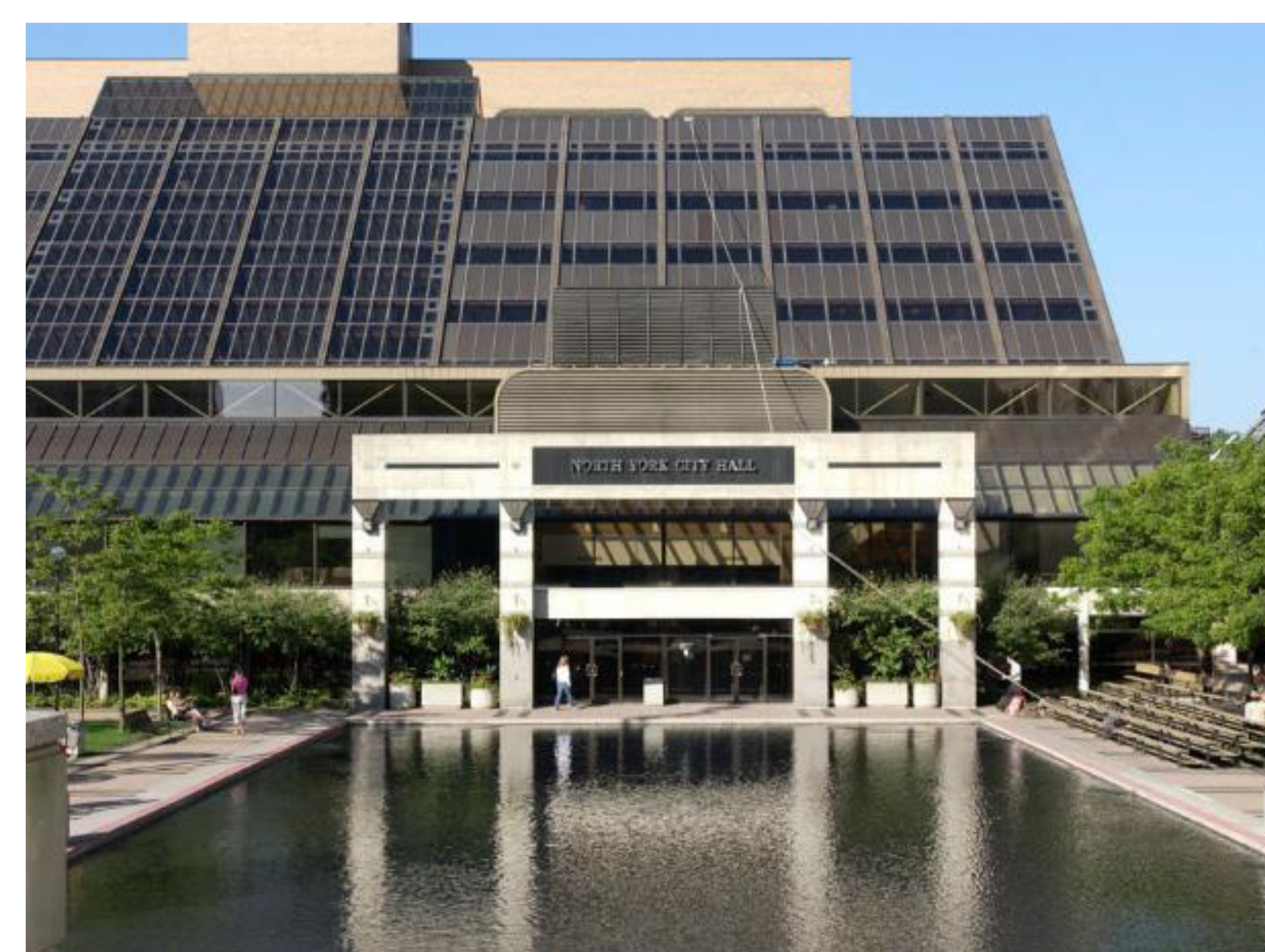
Figure 3: 2004 North York Civic Centre