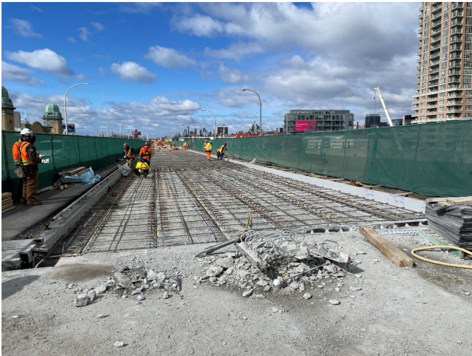
Crews reinforcing the bridge deck.