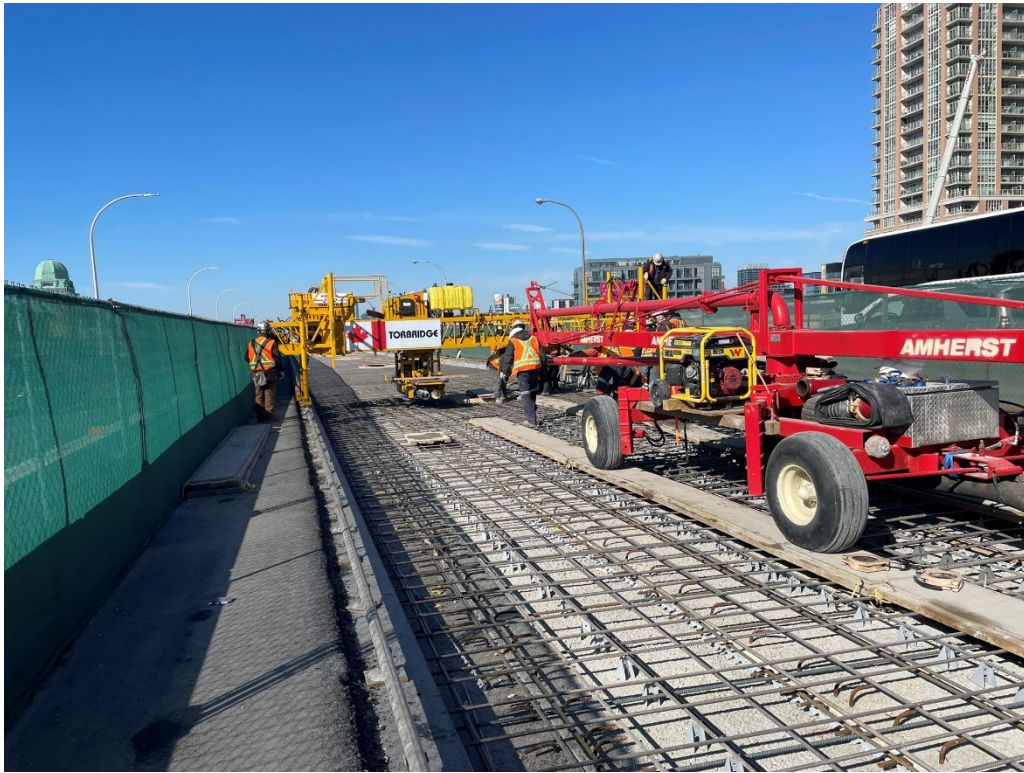
Crews performing preparation work for an upcoming concrete deck pour.