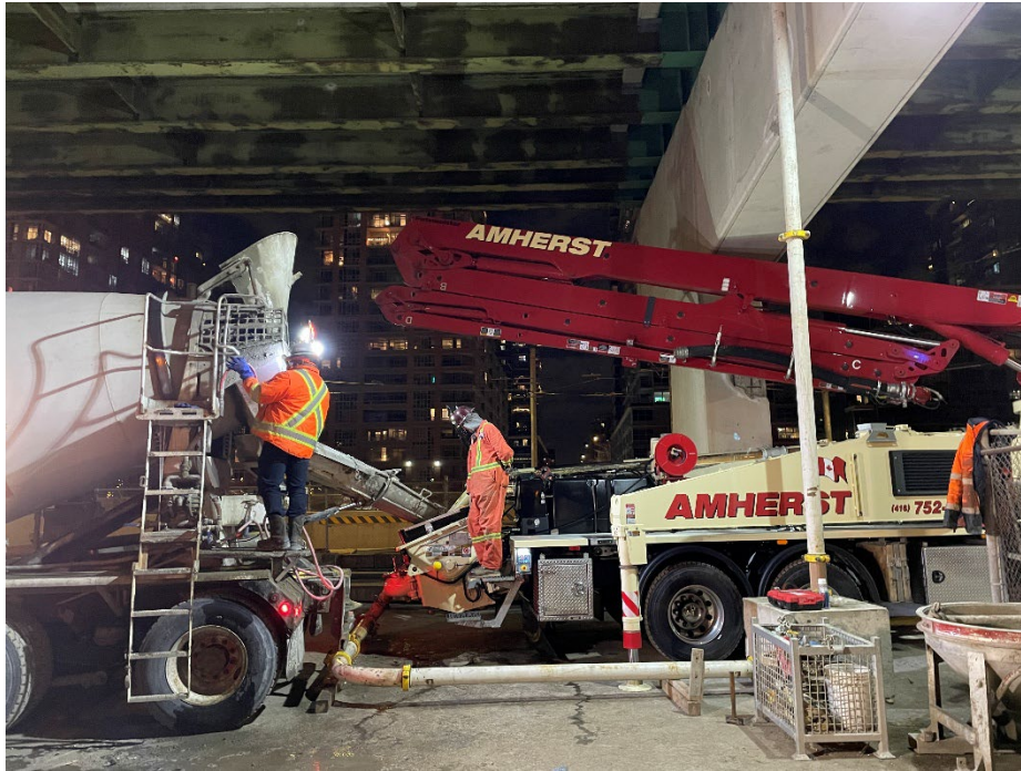
Concrete trucks in preparation for the concrete pour at the top of the bridge deck.

Visual Work on Site: The images below describe the type of work occurring on site during the week of March 31 st , 2025.