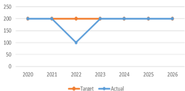
Number of Trained Emergency Operations Centre Staff