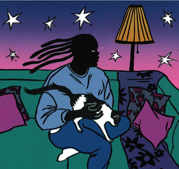
An example of reductive lino cut called “Dusk” by Khadijah Morley

The reductive linocut method involves creating colourful prints by carving away different layers from lino block. Students learn how to carve and print multi-layered linocuts by hand. This method is accessible and fun to do.