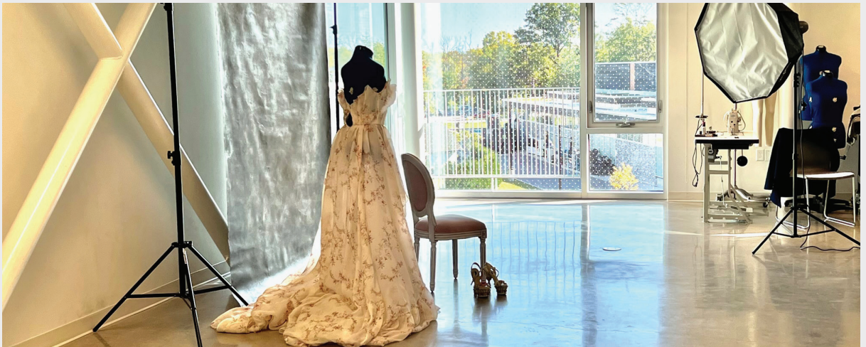
Rental of Studio 5 for a photo-shoot.

To speak with someone about booking your next event at the Clark Centre, call 416-396-4800 during office hours or email cca@toronto.ca . All bookings are subject to Toronto Public Health and Provincial Regulations and Guidelines and must align with City of Toronto Human Rights policies including the Hate Policy.