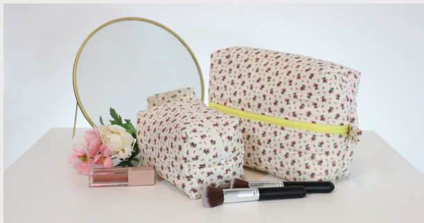
Learn to Sew: Travel or Cosmetics bag

Gain the fundamentals of sewing and basic quilting through creating your own toiletry or cosmetic bag. With easy-to-follow instructions and your own fabrics, students have the option to create one pouch. Bring your own sewing machine or use one of ours. This is a great starter project for anyone wishing to learn how to sew. This workshop requires an additional $15 material fee (cash only), payable to instructor for practice materials. Materials list will be provided.