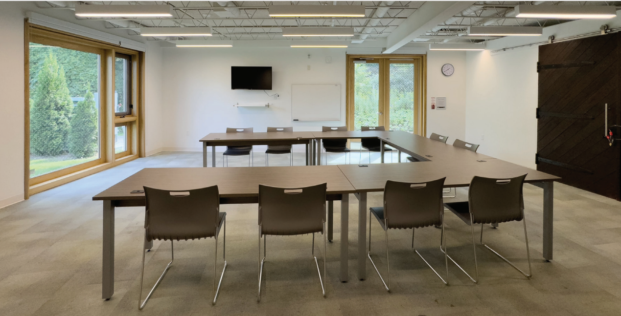
Digital Art Studio