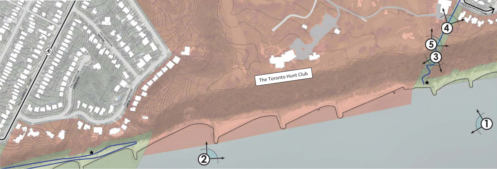
Segment 1 - Continued