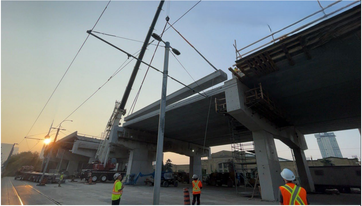
Stage 3 Girder Installations