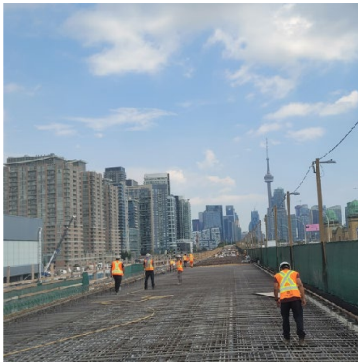
Stage 3 Bridge Deck Reinforcement