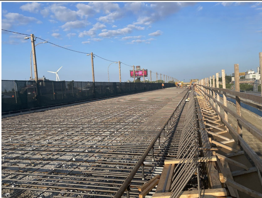
Stage 3 Bridge Deck Reinforcement Installation