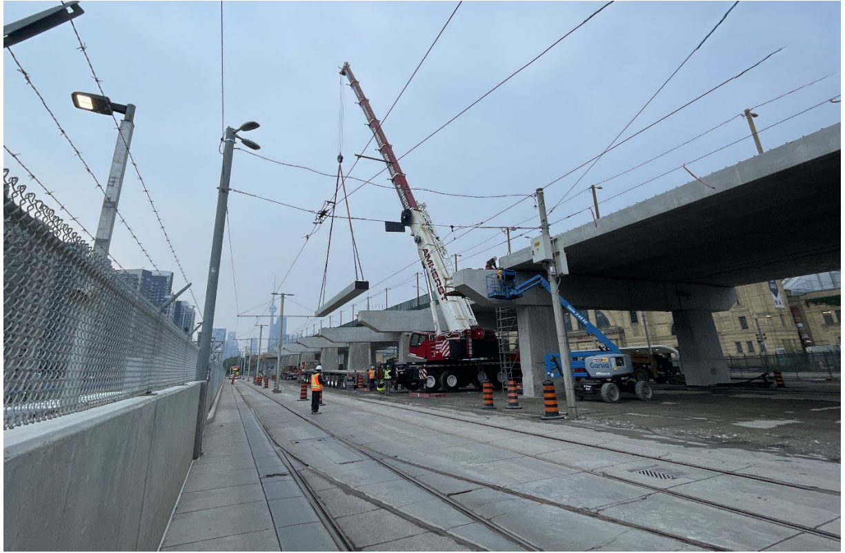
Stage 3 Girder Erection