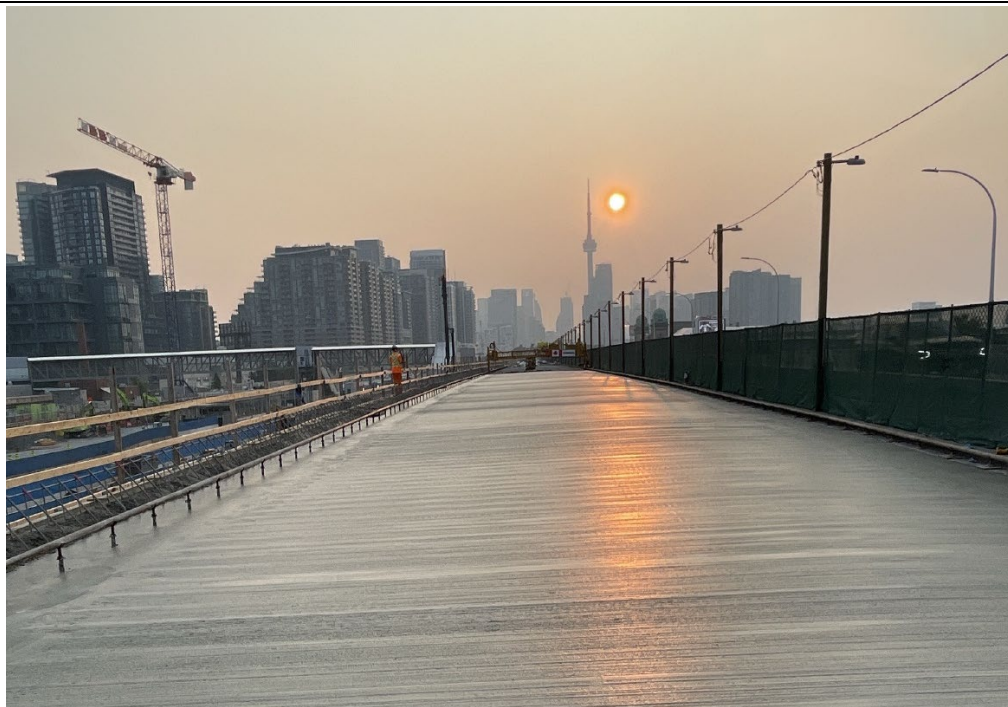
Stage 3 Bridge Deck Concrete Placement

Visual Work on Site: The images below describe the type of work occurring on site during the week of August 11, 2025.