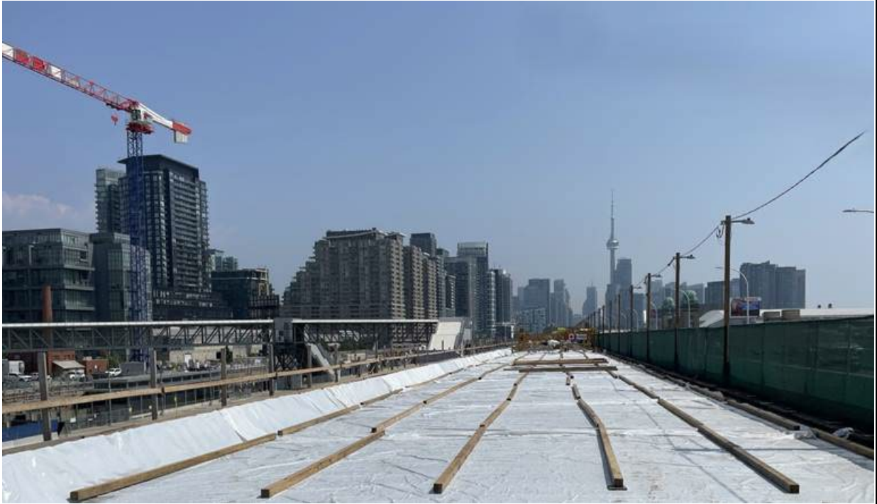
Stage 3 Bridge Deck Concrete Curing