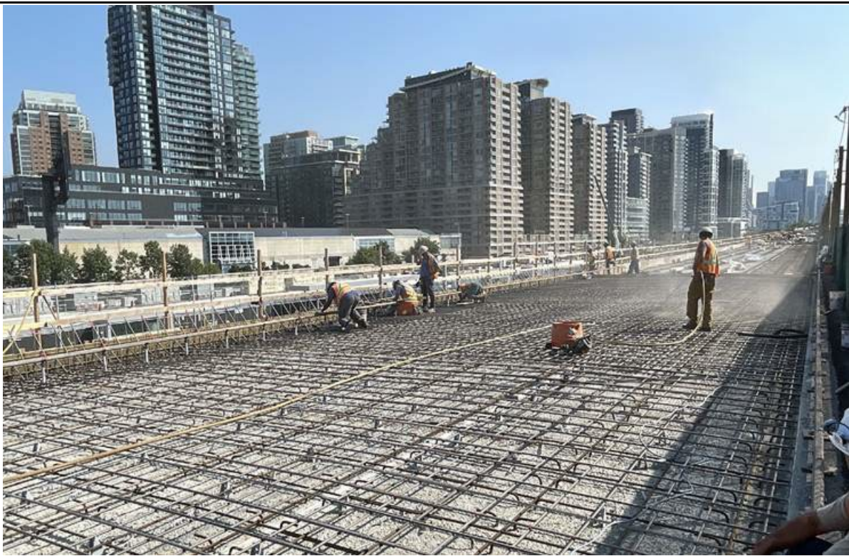
Stage 3 Bridge Deck Reinforcement Installation