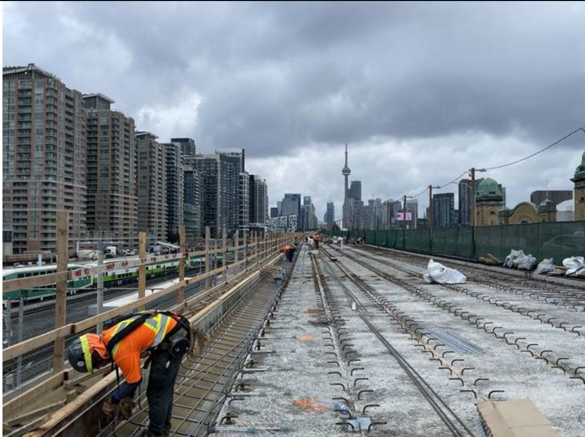
Stage 3 Bridge deck overhang reinforcement installation