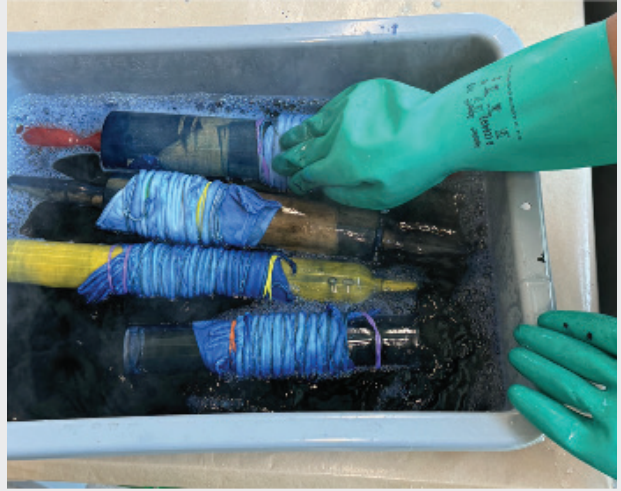
Tie & Dye: Shibori Scarves