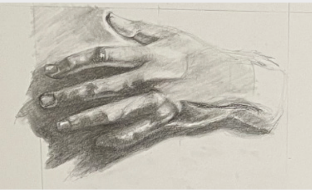
Drawing from the Round – hand by Marsha Leverock

Explore drawing basics including portraiture through working with casts and photographs to improve your drawing. Get hands-on with casts and photographs as you nail down proportions, head layout and facial feature placement. Use light logic to bring surface forms to life through a mix of lectures, demo drawings, and plenty of drawing time in class. Experiment with one graphite and one charcoal method on different types of paper, to create two take home projects. Materials list will be provided.