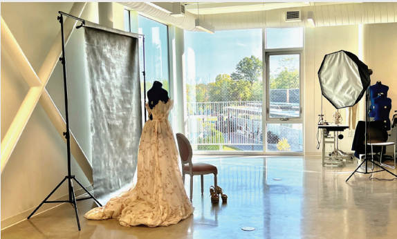
Rental of Studio 5 for a photo-shoot.

To speak with someone about booking your next event at the Clark Centre, call 416-396-4800 during office hours or email cca@toronto.ca . All bookings are subject to Toronto Public Health and Provincial Regulations and Guidelines and must align with City of Toronto Human Rights policies including the Hate Policy.