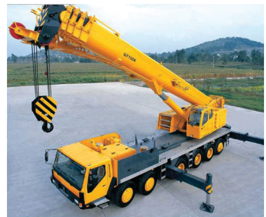
Example of a mobile crane

The building frame is expected to be complete by late 2025.