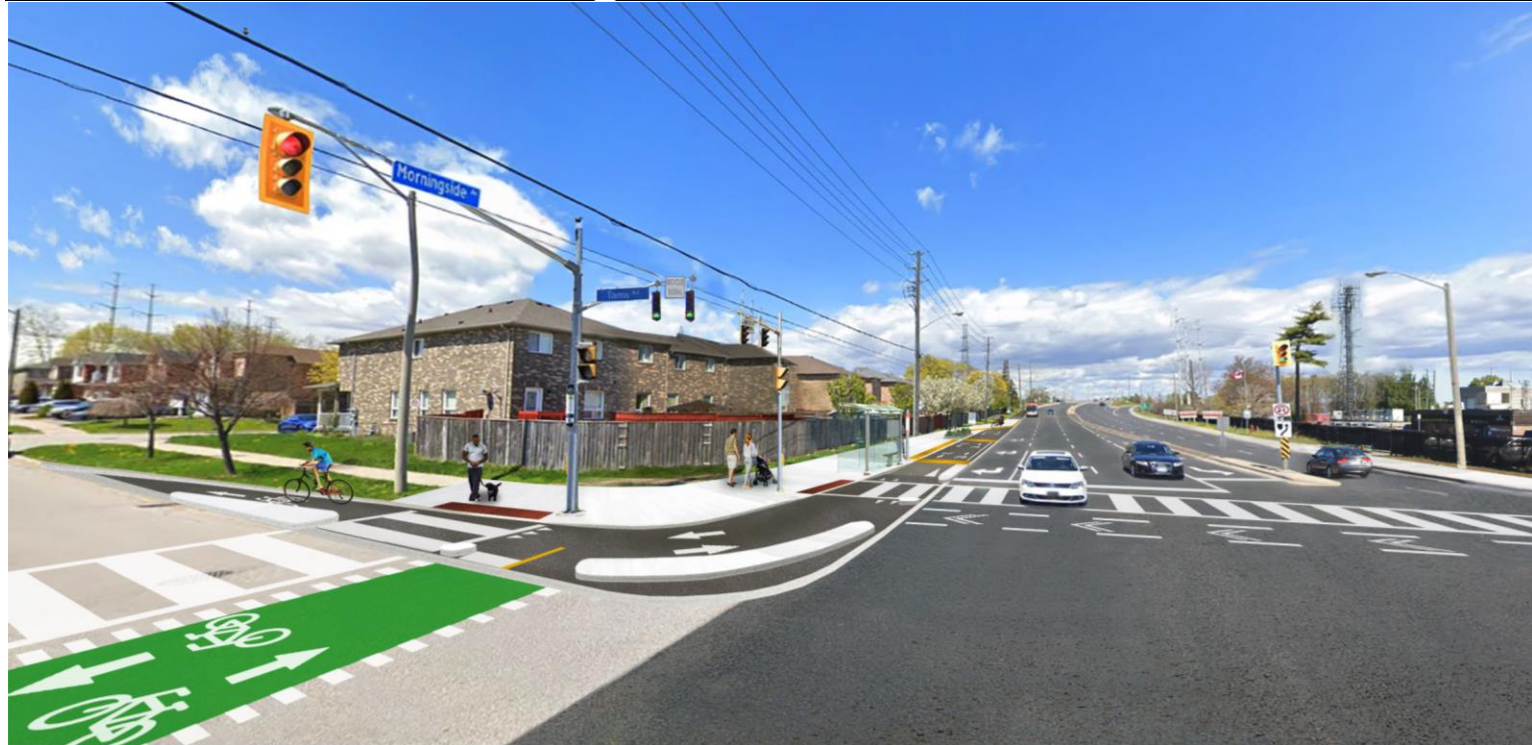
Artistic rendering of proposed changes at Morningside Avenue at Tams Road looking north

Road resurfacing is planned on Morningside Avenue from Tams Road/Pan Am Drive to the Highway 401 Eastbound Ramp in 2026. As part of this work, the Morningside Connections project aims to improve cycling and walking connections and road safety by installing a new sidewalk on the east side of Morningside Avenue from Pam Am Drive to the Highway 401 Eastbound on-ramp and a bidirectional multi-use trail (MUT) on the west side of Morningside Avenue from Tams Road to the Highway 401 Eastbound off-ramp and by making road safety improvements at the intersection of Morningside Avenue and Tams Road/Pan Am Drive. The project will not impact the number of motor vehicle lanes. See map below.