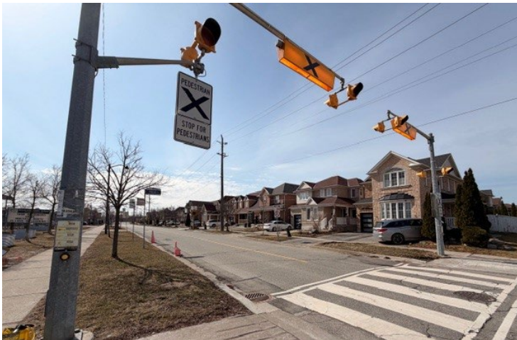
Photo showing a pedestrian crossing location.