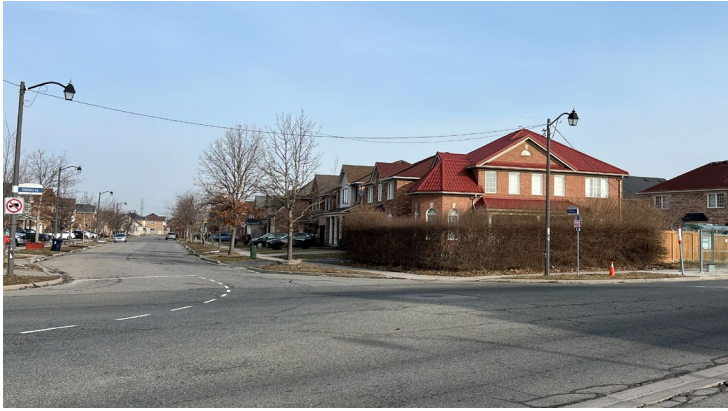
Photo showing an all-way controlled intersection with no crosswalks.