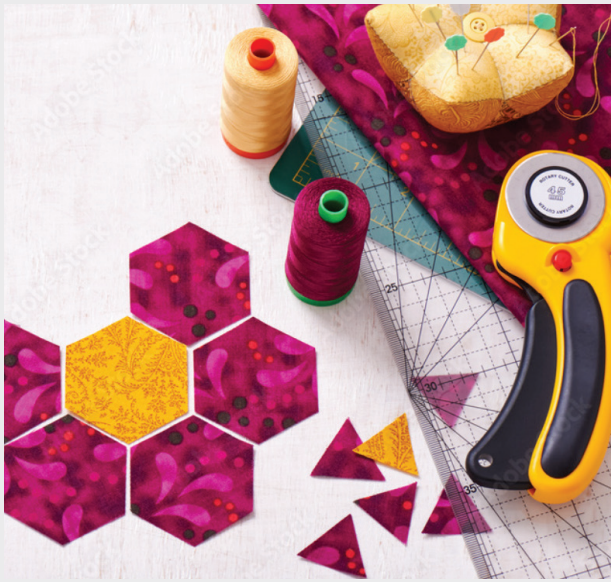
Paper Piecing Panel