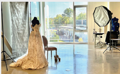
Rental of Studio 5 for a photo-shoot.

To speak with someone about booking your next event at the Clark Centre, call 416-396-4800 during office hours or email cca@toronto.ca . All bookings are subject to Toronto Public Health and Provincial Regulations and Guidelines and must align with City of Toronto Human Rights policies including the Hate Policy.