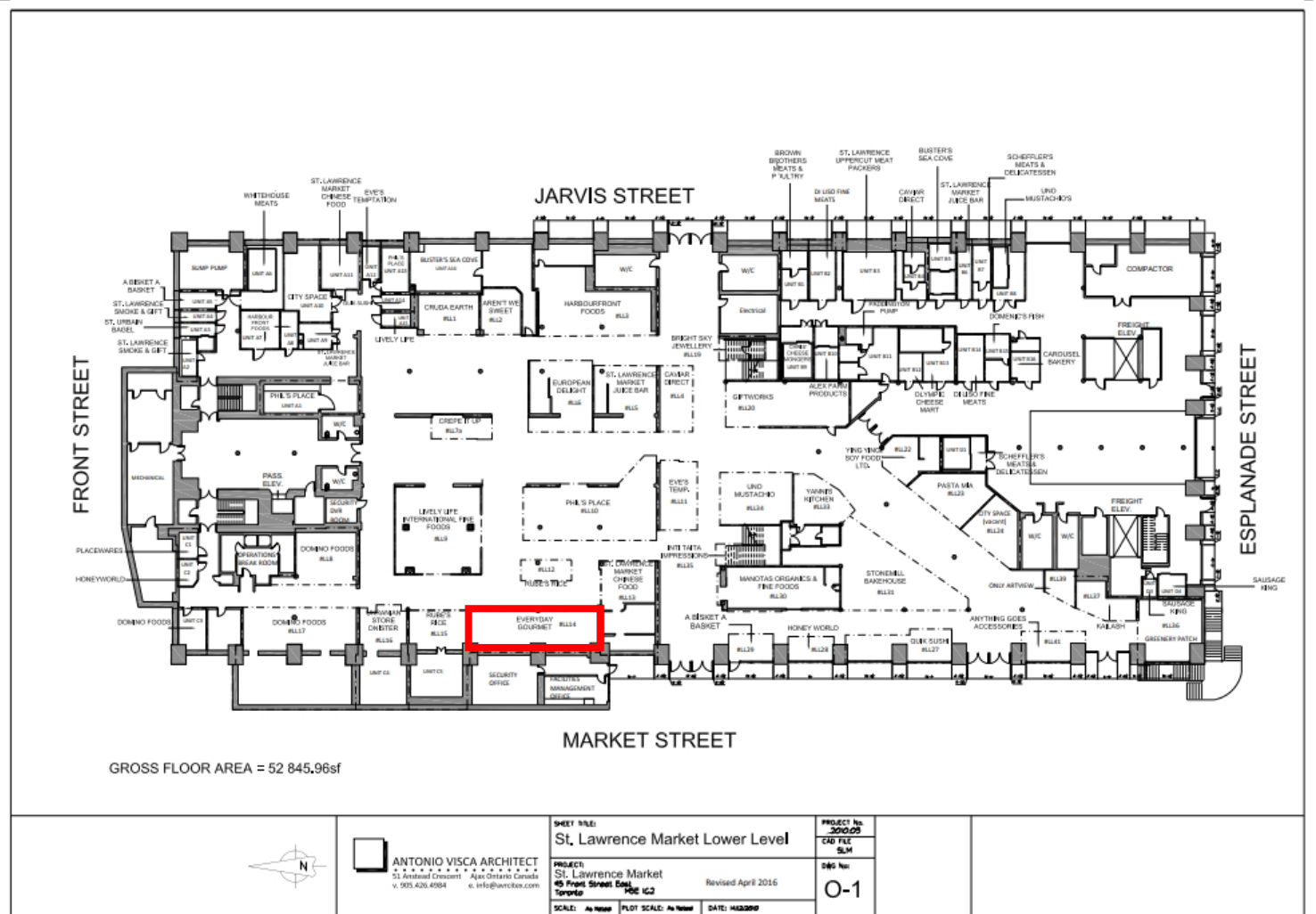
Leased Premises – outlined in red