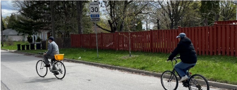
People cycling on a local street in the project area

In consultation with the local community, the City is developing a Neighbourhood Streets Plan for West Agincourt. The Streets Plan will recommend changes to traffic operations and road design to support safety and mobility for everyone using the streets.