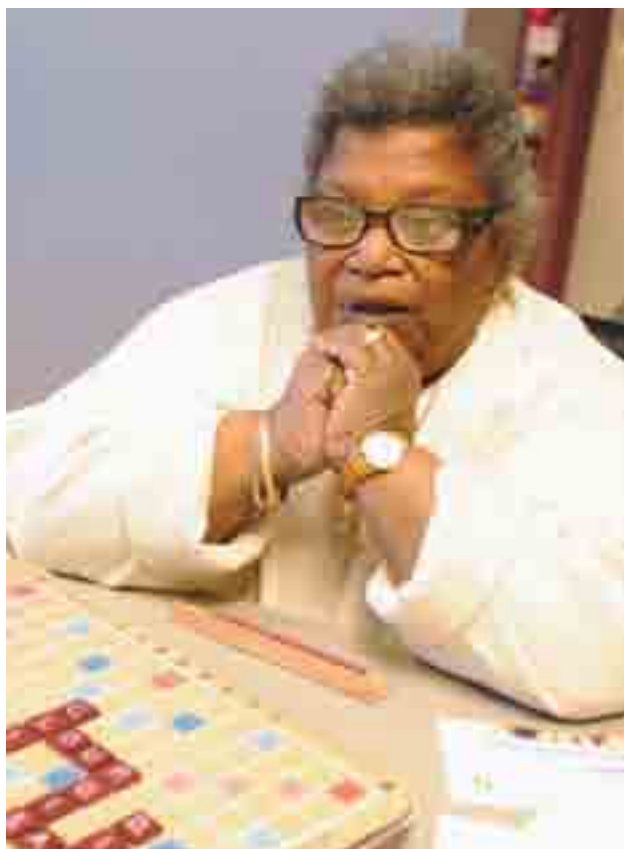
Stephen Leacock CC continues...