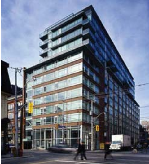
9. Adelaide St. E (15 storeys)