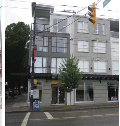
4. Vancouver (4 storeys)