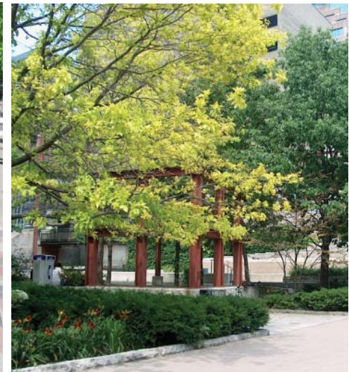
16. Cloud Garden - Toronto