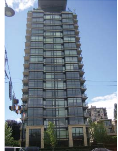
12. Vancouver (16 storeys)