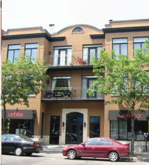
1. Montreal (3 storeys)