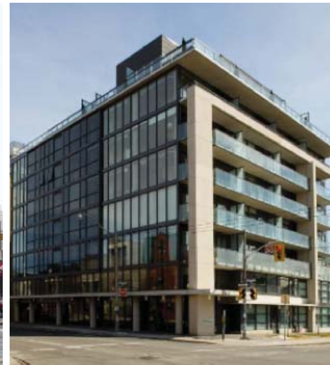
6. Portland Street (8 storeys)