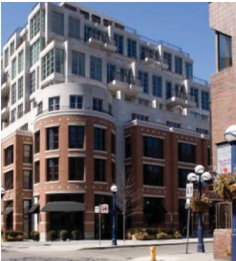
5. Yorkville Avenue (9 storeys)