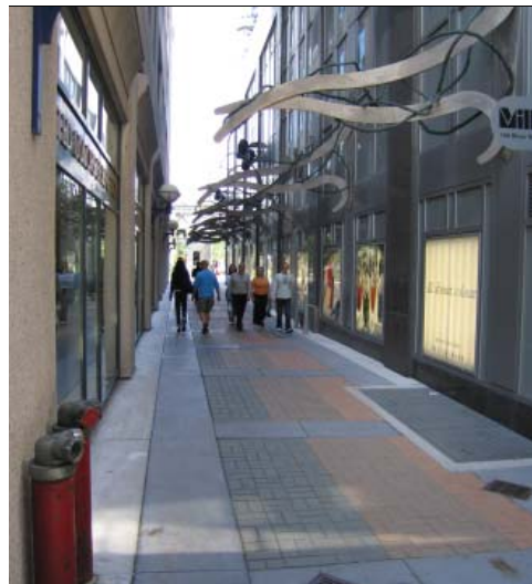
14. Mid-block connection (Yorkville)