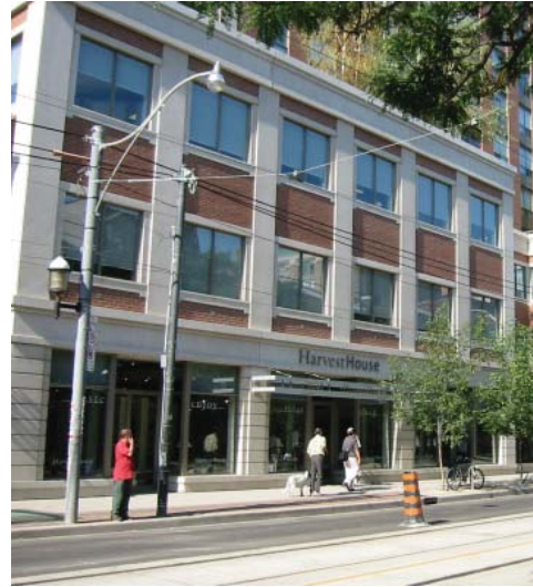
2. King Street East (3 storeys)