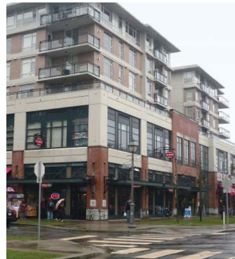
6. Vancouver (8 storeys)