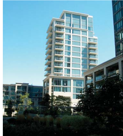
11. Toronto (15 storeys)