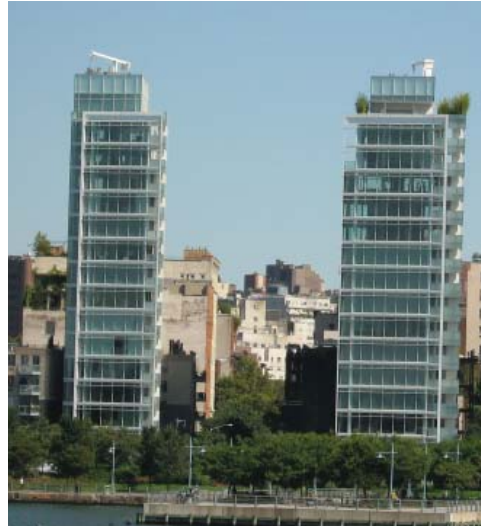
10. New York City (15 storeys)