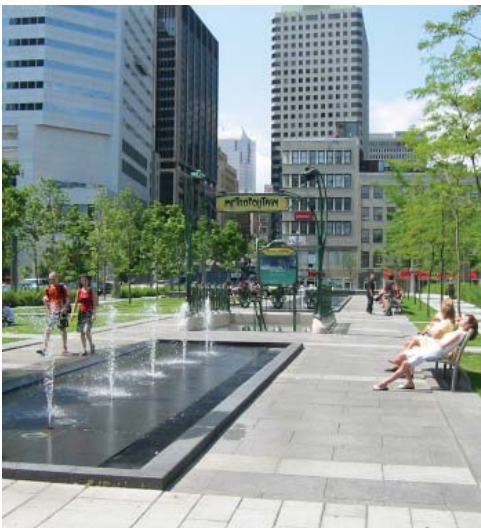
13. Square Victoria (Montreal)