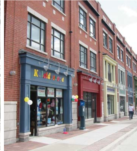
3. Port Credit Village (3 storeys)