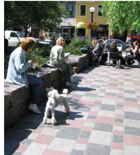
15. Urban Plaza - Yorkville