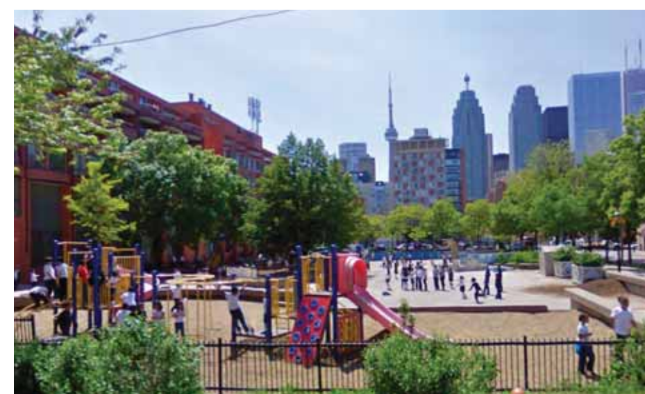
David Crombie Park