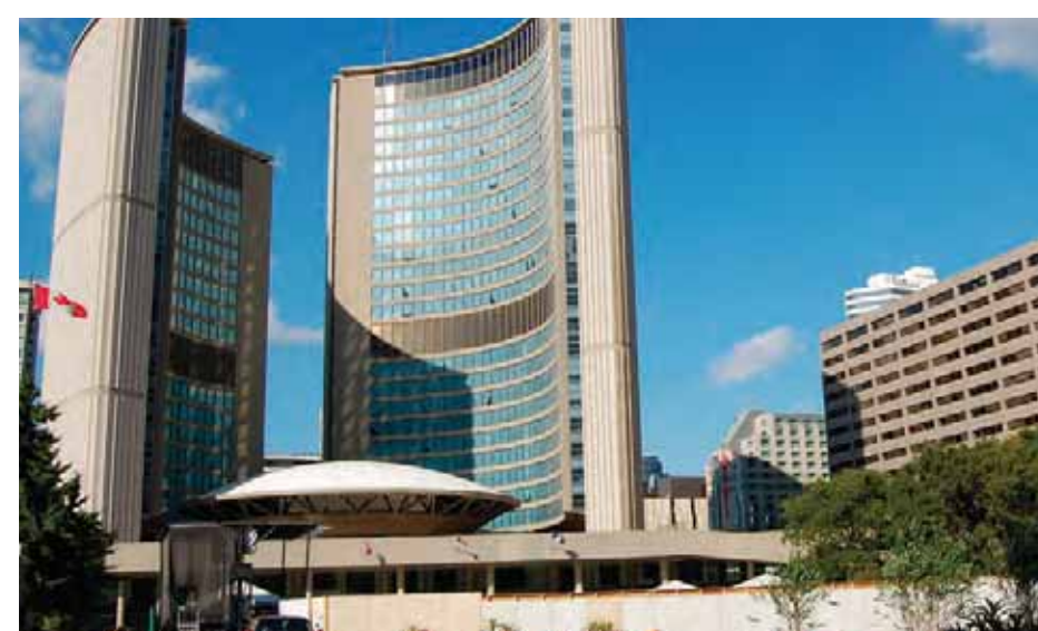
Nathan Phillips Square