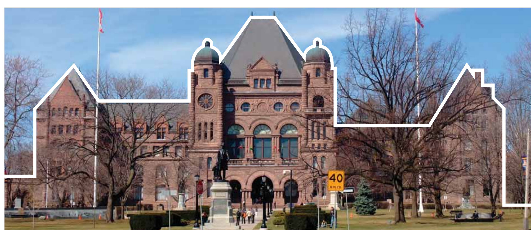
Queens Park - silhouette shown in white