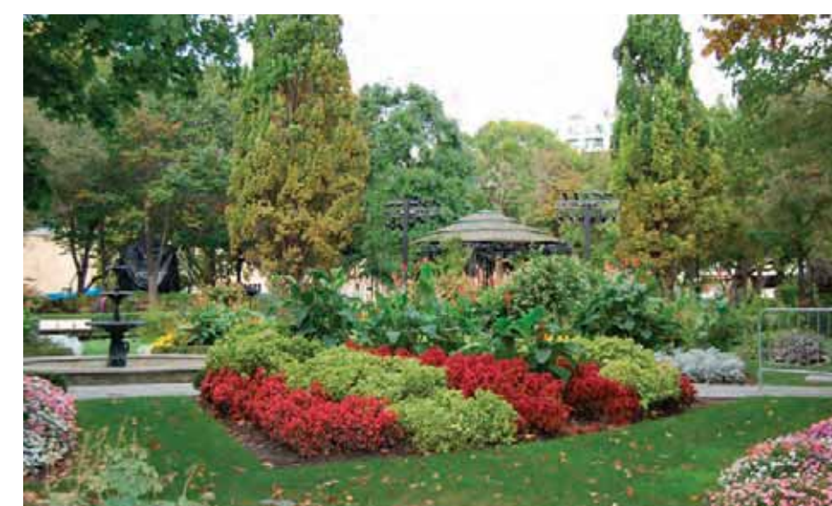
St. James Park

Regulation #15: Tall buildings will be designed and oriented to minimize shadow impacts on all parks and open spaces at all times of the day. No new shadows may be cast by any tall building on designated First Tier Parks between 10 AM and 4 PM on September 21st. No new shadows may be cast by any tall building on designated Second Tier Parks between 12 noon and 2:00 PM on September 21st.