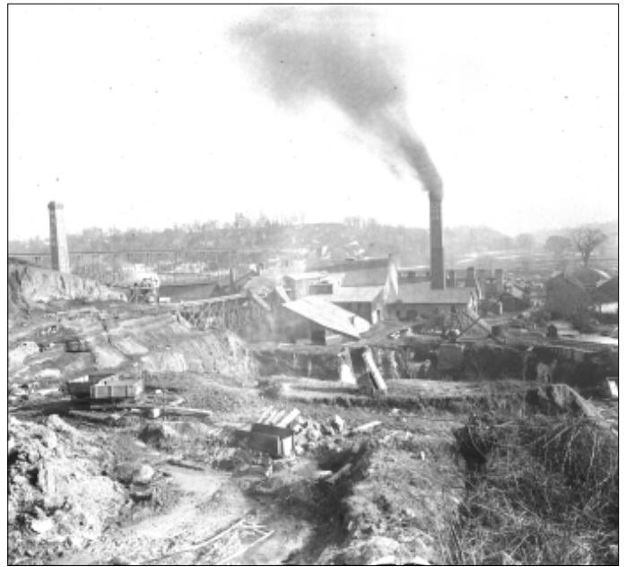
Don Valley Brick Works, circa 1891, SC 128, Subseries 1, Item 1160

For general information, see the information file titled "East York." You may also find other information files about more specific topics, such as smaller communities within East York (such as Leaside), and landmarks (such as the Don Valley, the Don Valley Brick Works, and Todmorden Mills). For a list of information file titles, please consult Reference Desk staff. For a list of East York mayors and other municipal information, please ask Reference Desk staff for the binder entitled "East York Reference Highlights." For information regarding origins of street names and street name changes, see the back of the binder titled "Street Names M-Z" in the Research Hall.