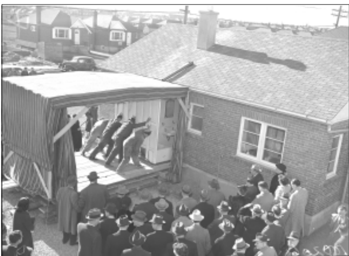
"Unutility house," Leaside, November 15, 1945, SC 266, Item 100206

An additional but small group of aerials shows areas around the Don River from 1937 to 1942. These aerials are known as Series 97, Aerial Photographs of Valley Lands. To see these aerial photographs, ask the Reference Desk staff to retrieve them from the vault.