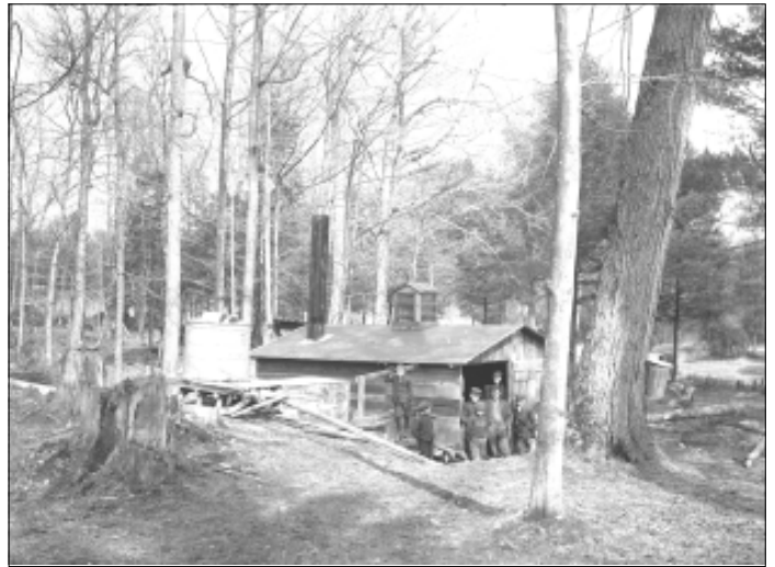
Maple sugar hut, Don Valley, 1913, SC 213, Item 1191