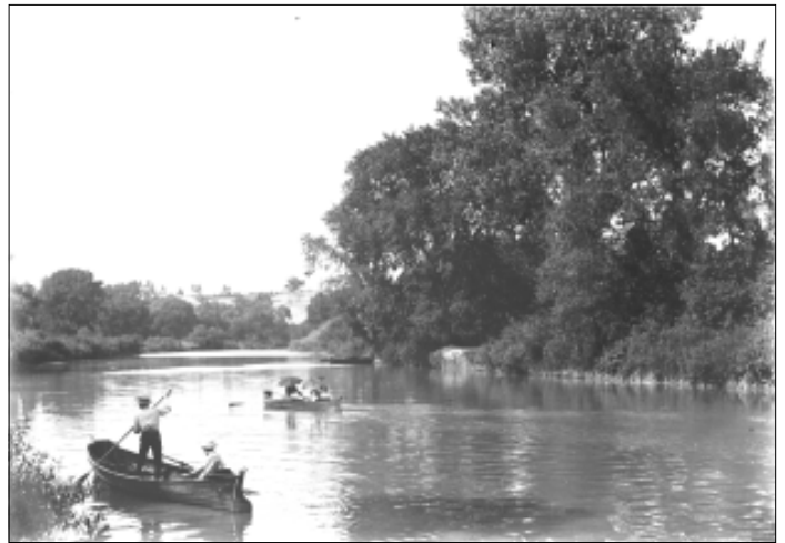
Humber River, June 1891, SC 128, Subseries 1, Item 1202