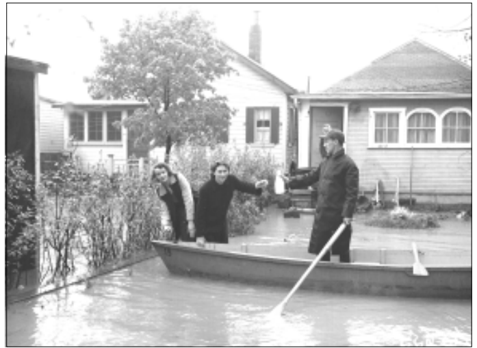
Flooding, June 2, 1947, SC 266, Item 115655

The City of Toronto Archives is easy to get to by public transit. Exit the University subway line at Dupont station and walk north.