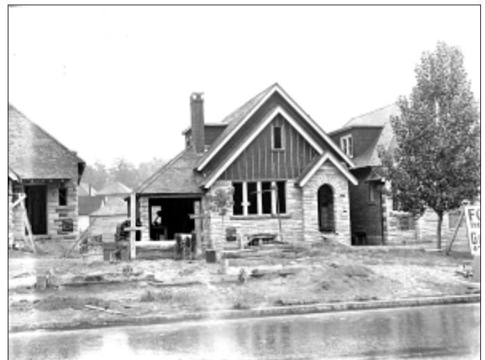
Construction on the Kingsway, June 17, 1936, SC 266, Item 40448