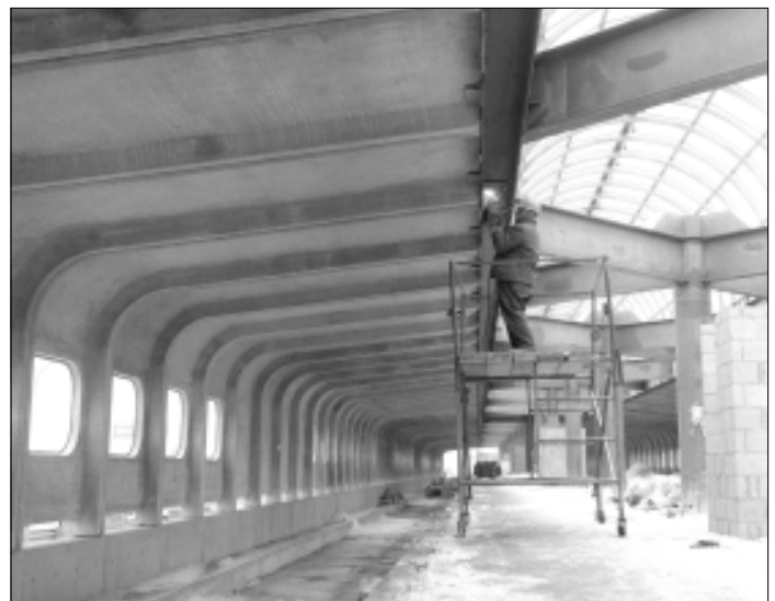
Construction of Yorkdale subway station, February 18, 1977, TTC photograph files, "Spadina Subway Project"