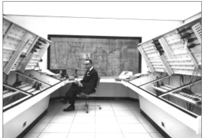
Central Pumping Control Supervisory: High Level Pumping Station, 1970, Series 4, Sub-series 1, Item 723

To find maps showing Metro, look in the binder in the Research Hall labelled "Cartographic Collection," and also use the Gencat database. Reference Desk staff can show you how to use the database. Of particular interest are the TTC Planning Maps (Series 260) and Maps and Plans of the Planning Department (Series 210), both of which include maps showing transit routes, roads, population, land use, and other information. The Archives also has several atlases that may be useful. They are found in the section titled "Atlases" in the main area of the Research Hall.